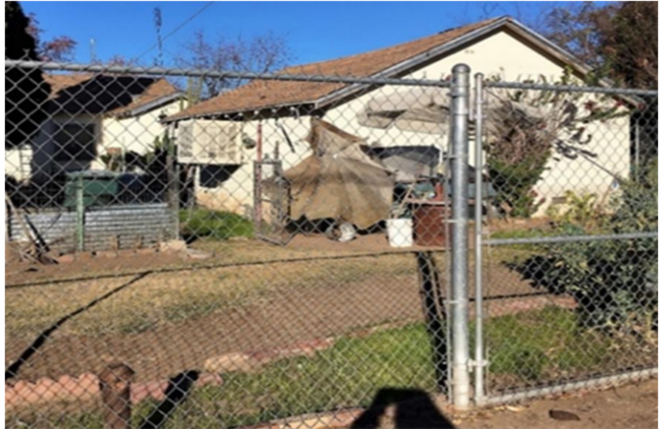
Clue to Occupied Housing: Fresno, CA. Swamp Cooler