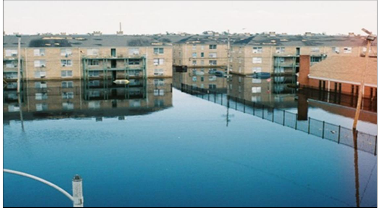
Public Housing Flooded, following Hurricane Katrina, 2005