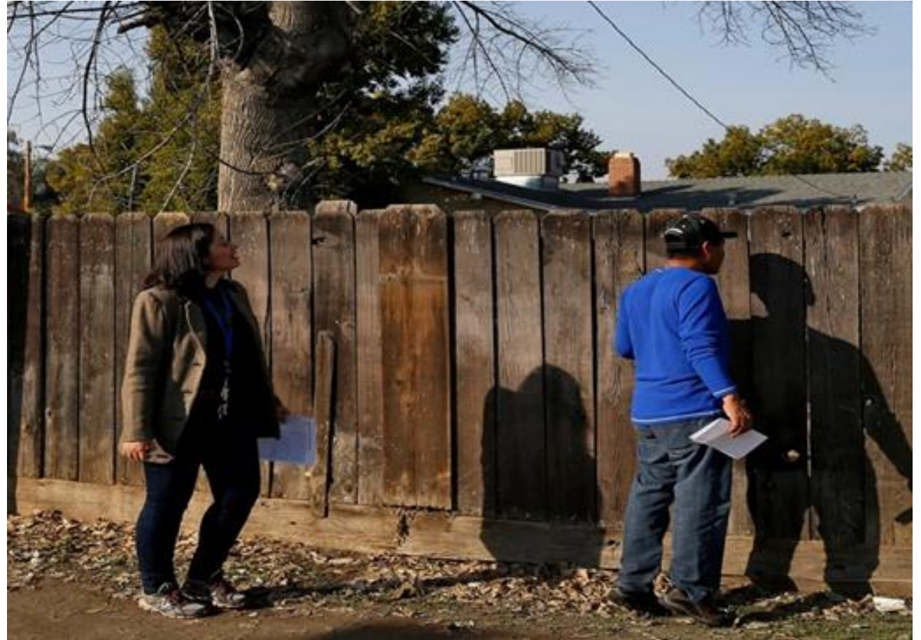
Observing Hidden Housing Unit