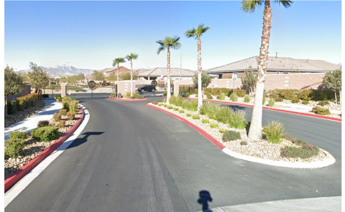
Center of North Las Vegas Study Area looking North Source: Google Maps Accessed March 1, 2025