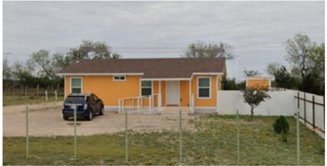
Hidalgo County, Texas