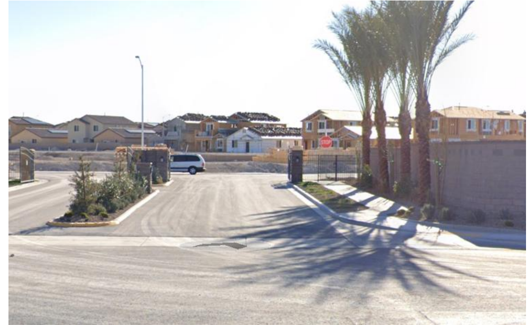
Center of North Las Vegas Study Area looking South: Note new construction continuing across the way.