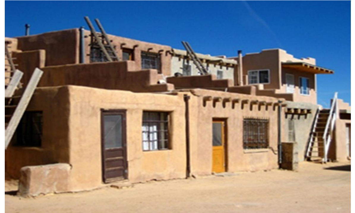
Acoma Pueblo, New Mexico