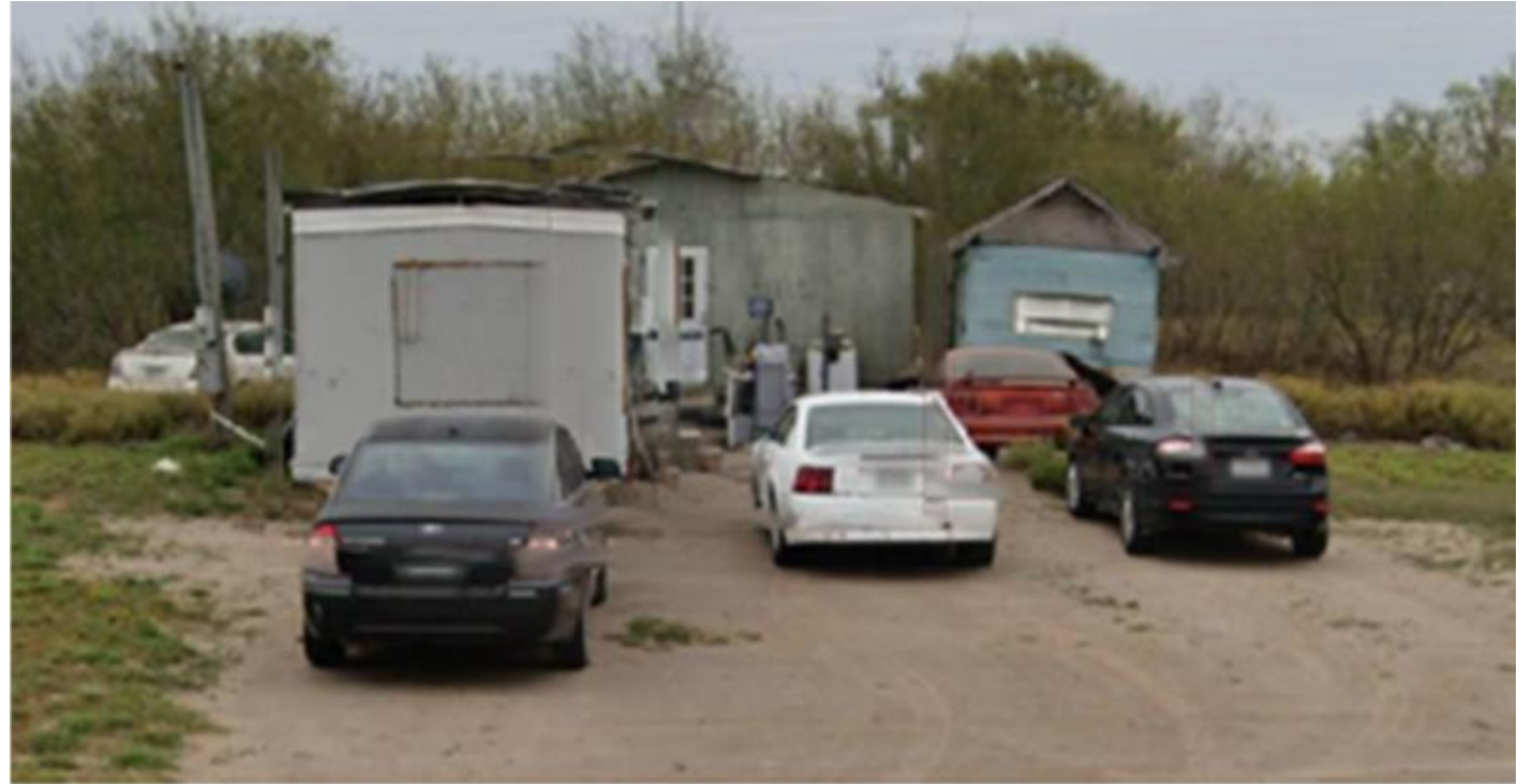
Hidalgo County, Texas