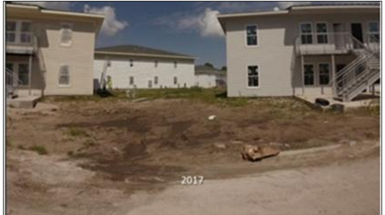
2 Oaks Apartments construction nearing completion in 2017