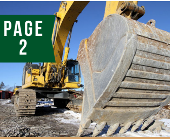
Capital Improvements in Bernalillo County