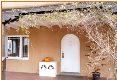
Sorority House 1929