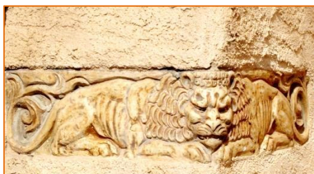
Alvarado Hotel ceramic lion