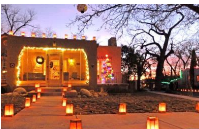
Van Cleave House 1927