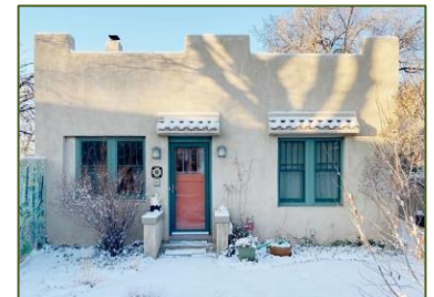
Curnow House 1923