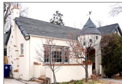
Tessier House 1930