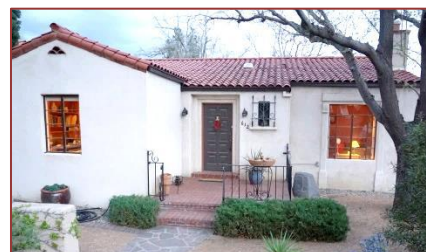
Cottonwood House 1945