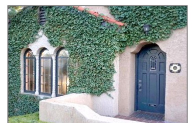
Benton House 1926