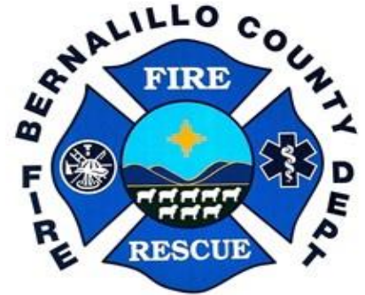
Bernalillo County Fire