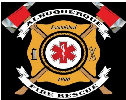
Albuquerque Fire Rescue