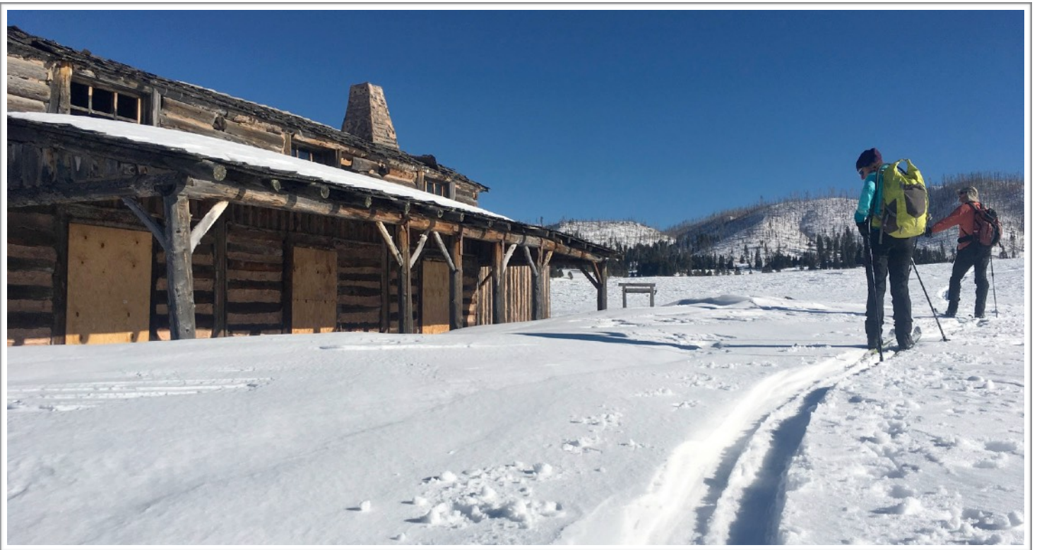
(Valles Caldera day trip)

5) If you want to rejoin the email list or you are changing your email address...Send an email to 'egroup@nmccskiclub.org' with your email address and full name. Your membership will be verified and you will be reinstalled in the Server List.