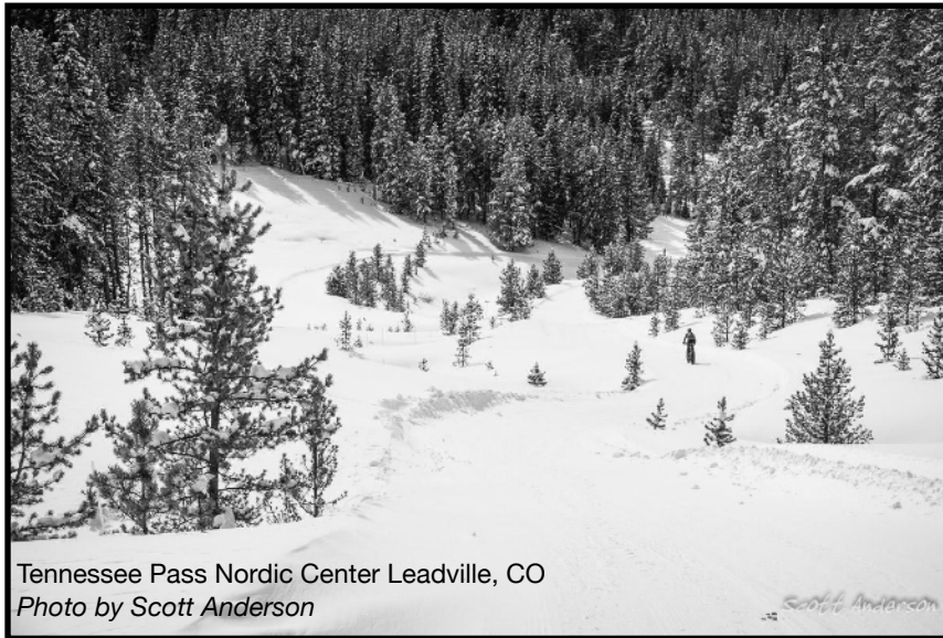
Tennessee Pass Nordic Center Leadville, CO

Telemark skiing here is great for beginner to intermediate free-heelers. The more advanced skiers can also have a blast just enjoying a laid back day with a variety of terrain challenges. Adjacent to the Alpine area is a Nordic center with 27 kilometers of groomed trails. One can easily