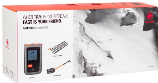
Barryvox avalanche beacon kit with probe and shovel