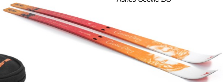
Åsnes Cecilie BC