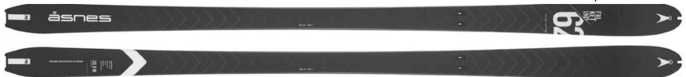
Åsnes Falkentind 62 explore