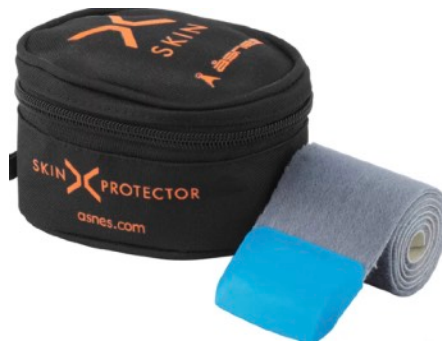
Kicker skins (Åsnes X-Skin system in nylon and mohair)