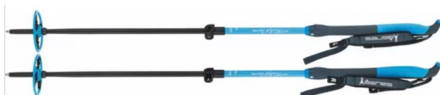
Poles (Åsnes Nansen 2-section collapsible)