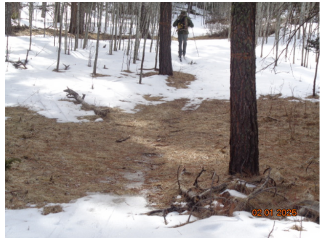
Sadly typical conditions last winter in the Jemez Mountains

We are excited about the 2025/2026 season. Cross your fingers, hold your thumbs, and pray to your relevant deity for a better winter this year!