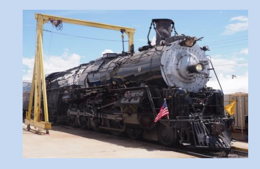
Santa Fe 2926

the beautiful dream machine, is now running after years of work. They will be collaborating with WHEELS to bring 2926 "home" to the railyards with access to the main line and the irreplaceable turntable that is located just east of the museum. The ultimate goal is to develop a true rail heritage park that will include tourist trips with the locomotive pulling historic passenger cars including WHEEL's Silver Iris 1952 sleeper/lounge car.