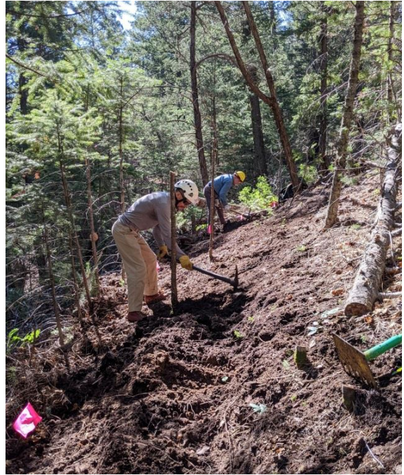
First remove the duff to find the soil, then bench into the slope to build the tread.