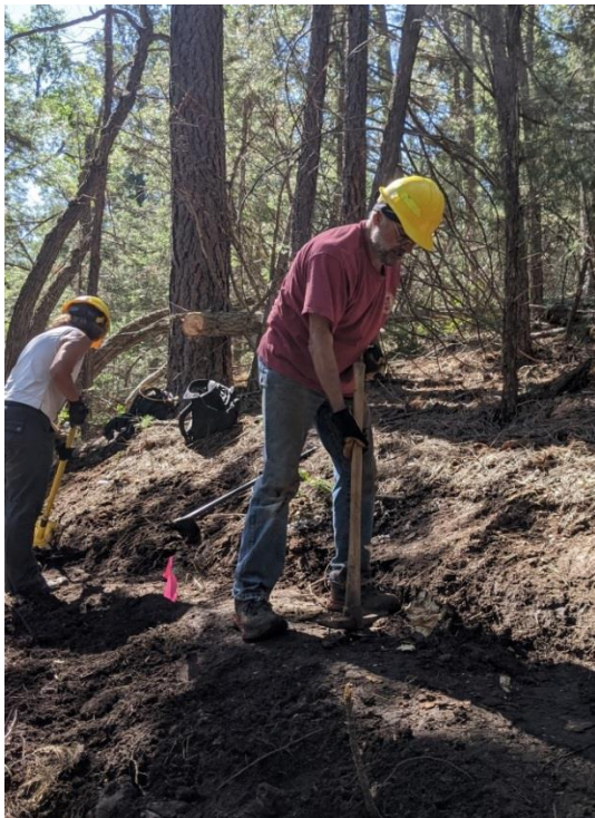
... or any sharp tool will do.