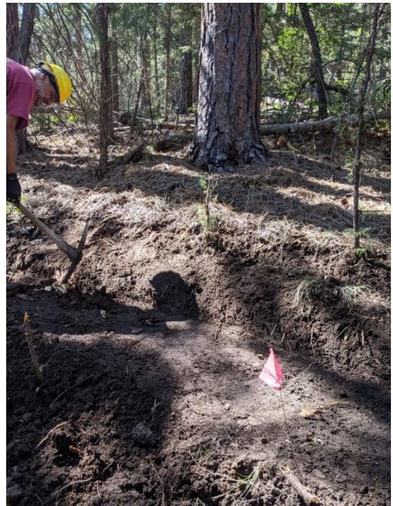
Nice crisp hinge