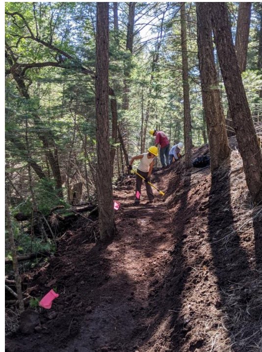
The trail starts to take shape.