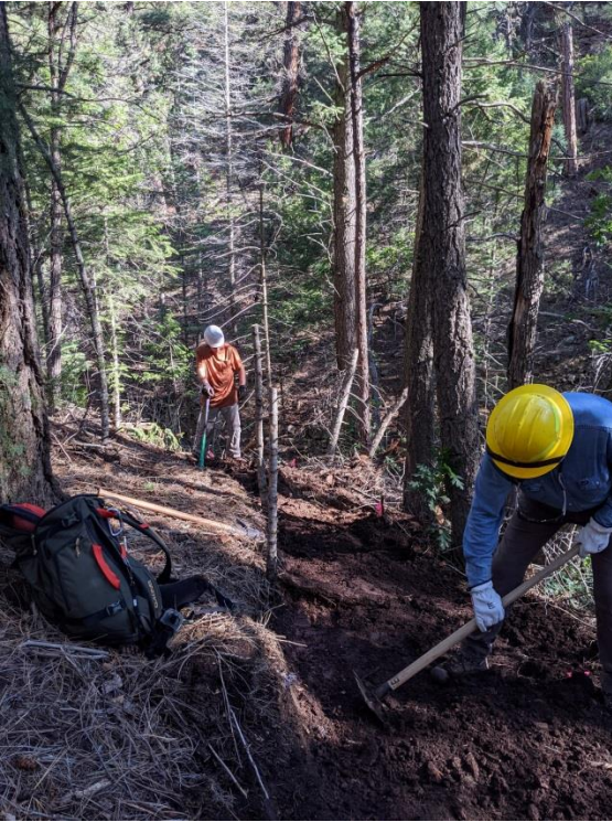
Look Ma, no rocks!