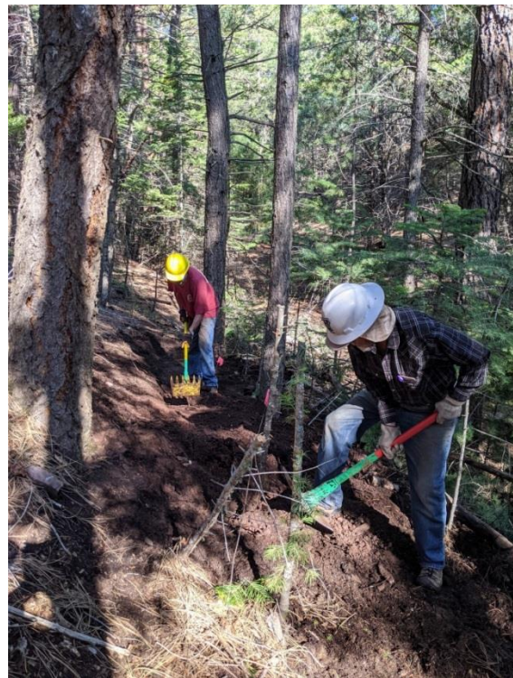
A cool morning in the forest