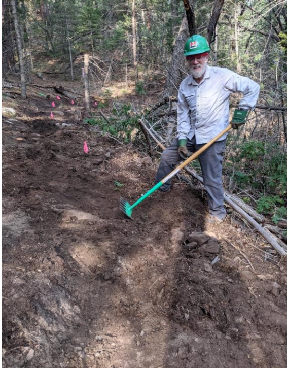
Add some drainage