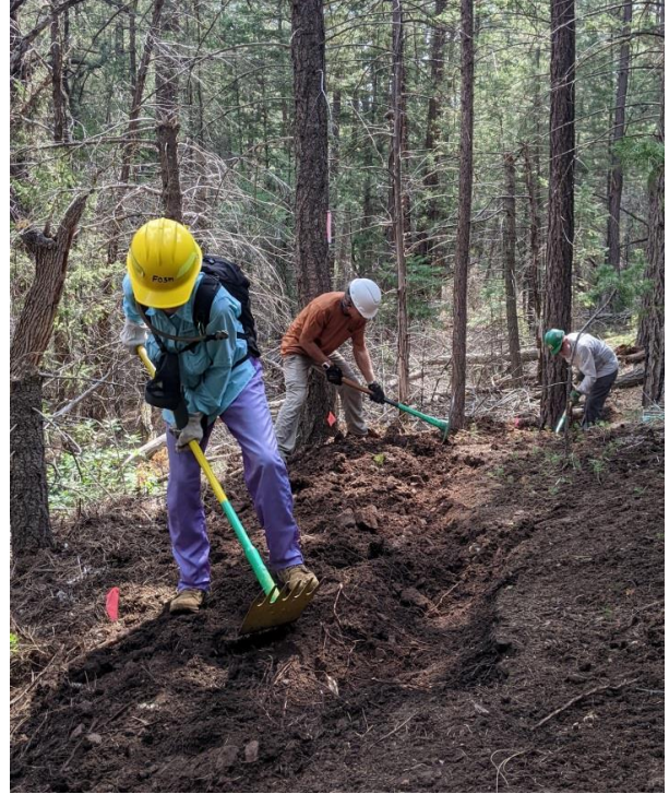
Move some more dirt