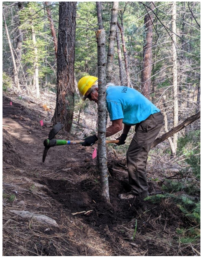
Digging out a high-stump