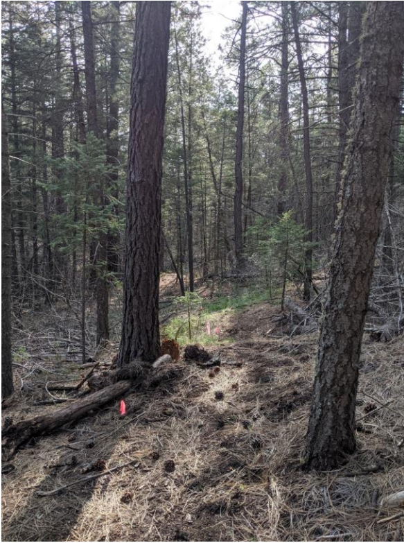
A couple of before & after's