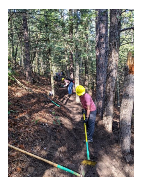
Visitors! (Look closely)