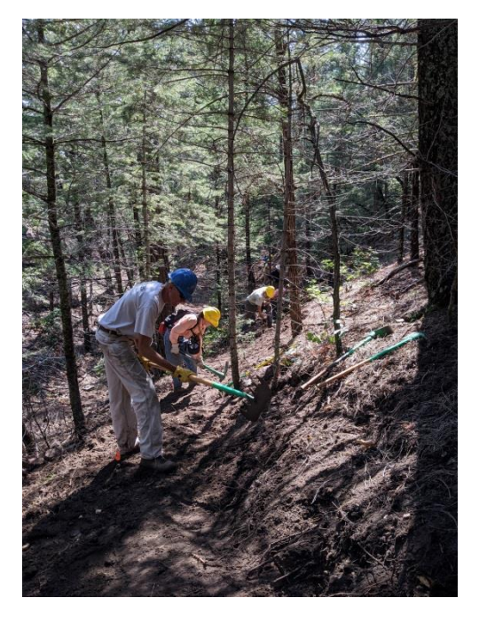
The lucky ones find a shady spot.