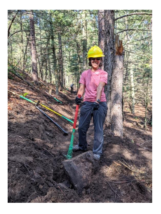
Pat's White Whale