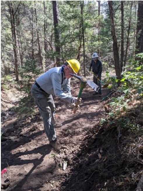
The old trail is visible in the drainage below. Pulling debris onto it helps close it off.