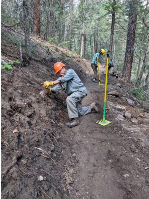
This stump could snag an equestrian or biker.