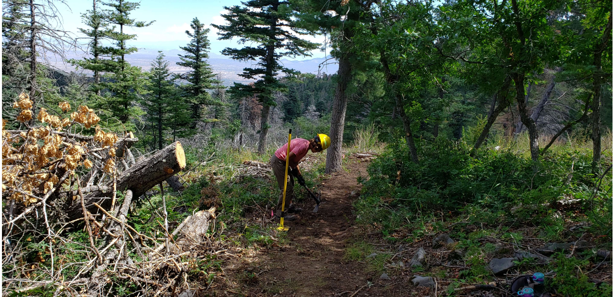
Finishing Tread on the Challenge Trail – Great Views