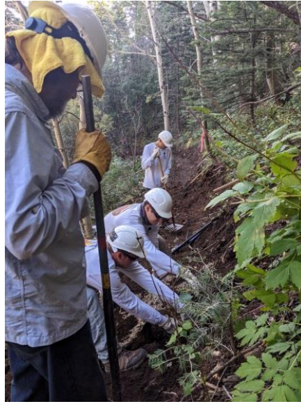
A little teamwork