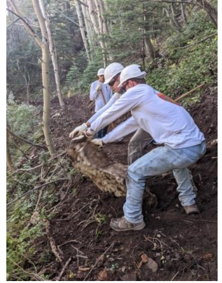
Move it down