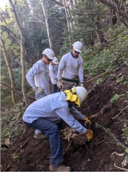
I'll get you started