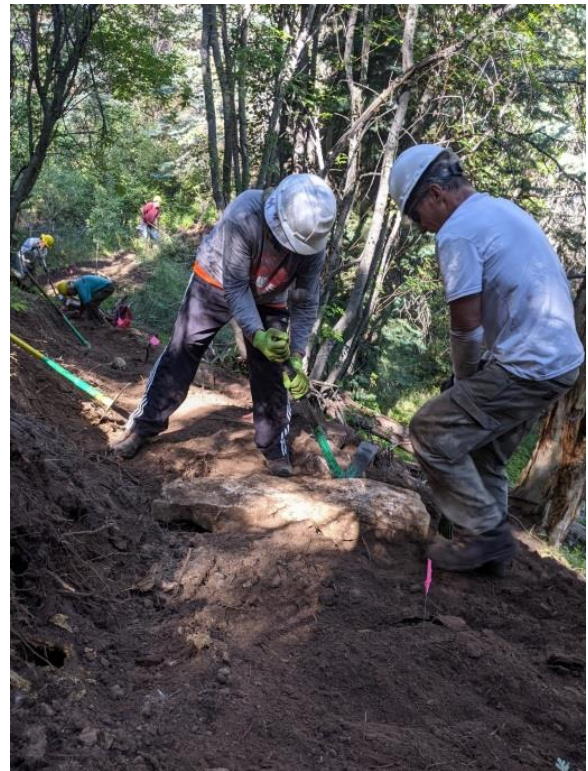
We don't need no stinking rock bar...