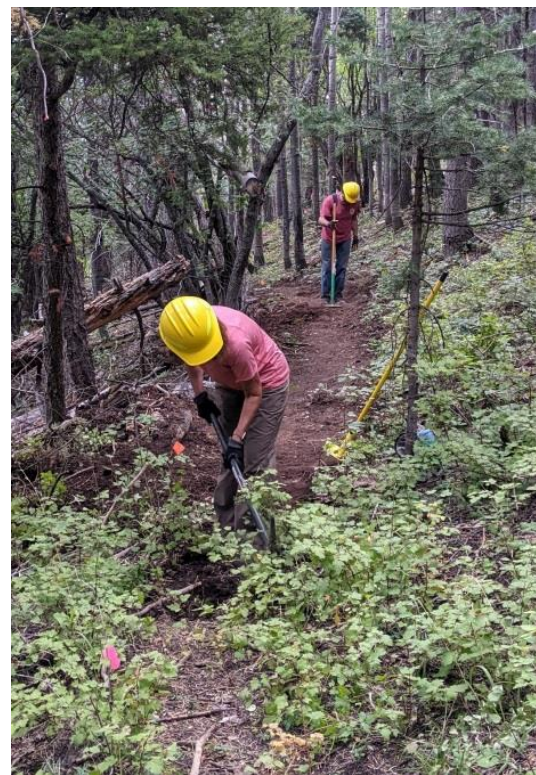
Getting started on a cool morning