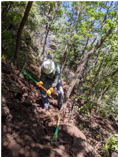
It was in the ground. Now it's not.