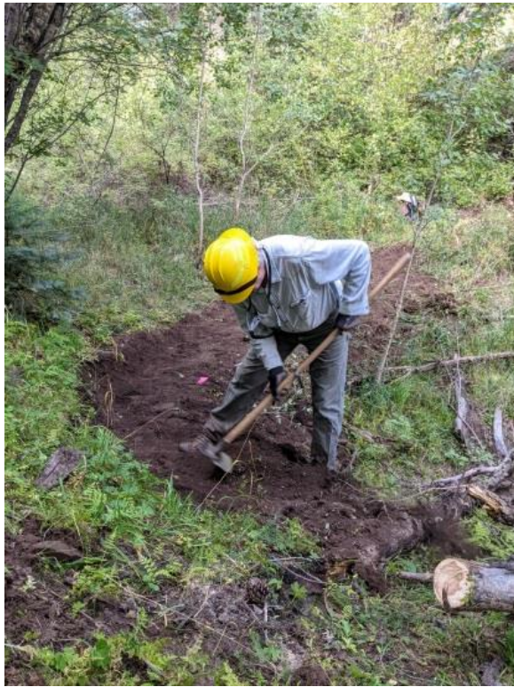
Rounding the corner