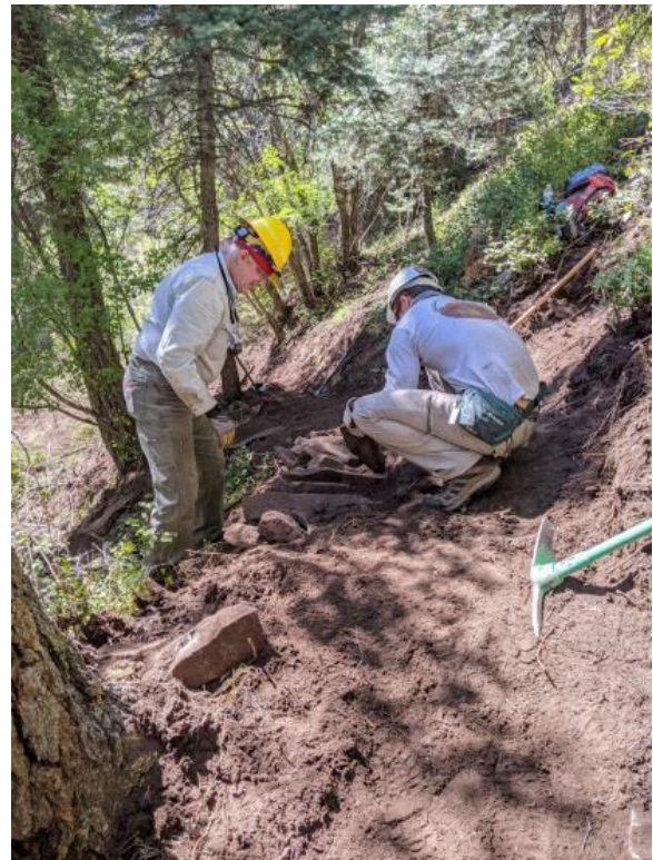
Here's how it's done, lad.