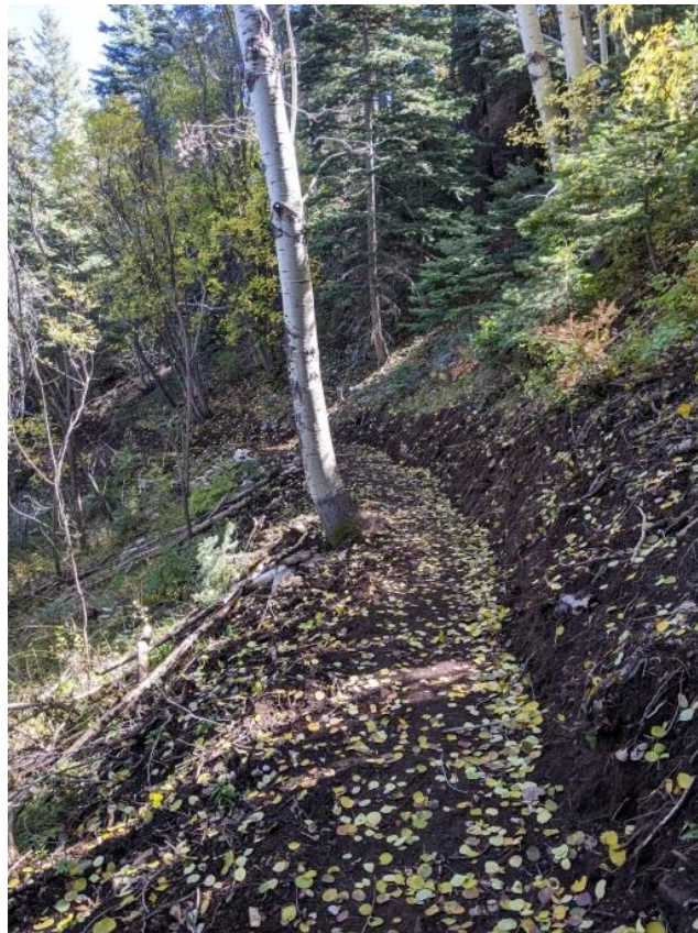
A lovely fall morning