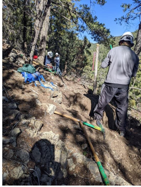
Roots and rocks