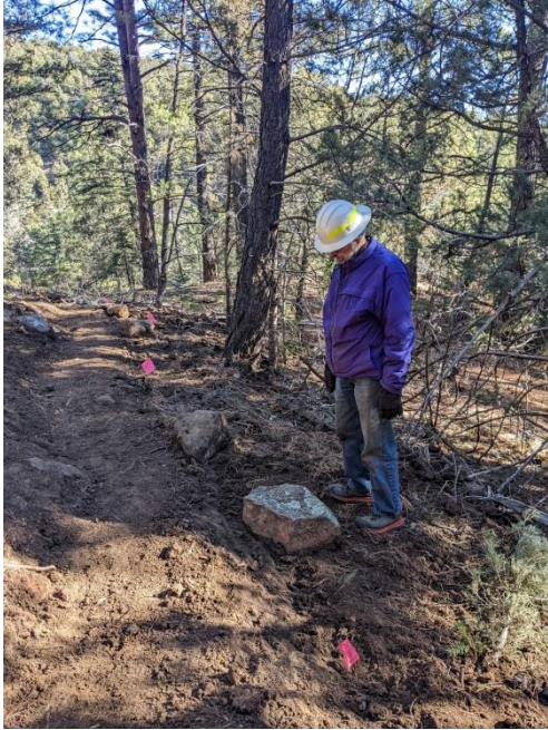
How to herd horses (and bikes)