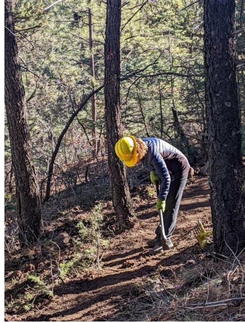
Nice in the sun