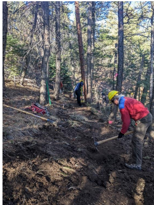
The Maddens tackle the tough turf