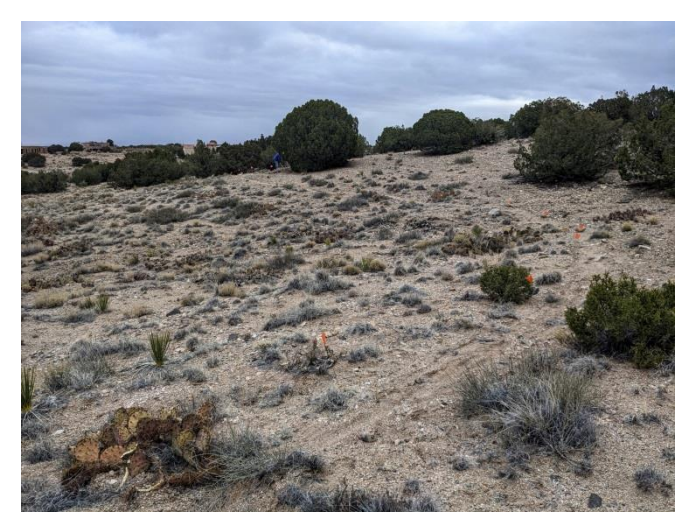
Before, near the junction. Bikers had started riding the flag line before the trail was built.