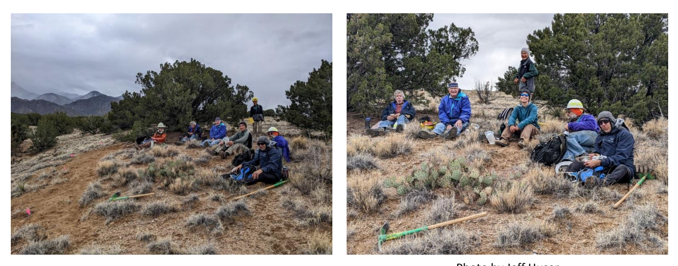
The best part of the day deserves double-documentation