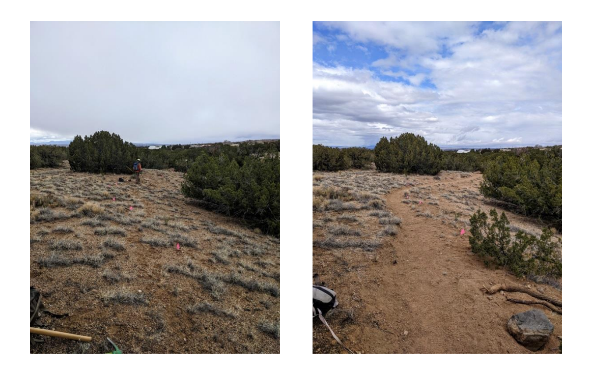
Before and after at the second location. The finished trail will wend its way northwest towards Forest Lane.