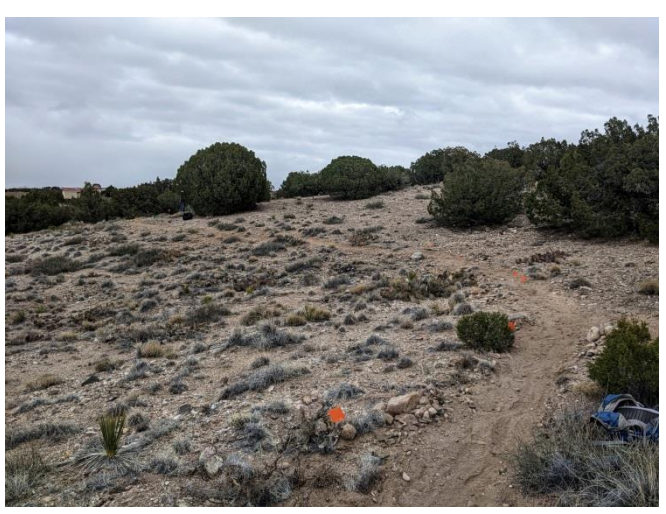
After. (Might look more impressive if the photographer were taller...)