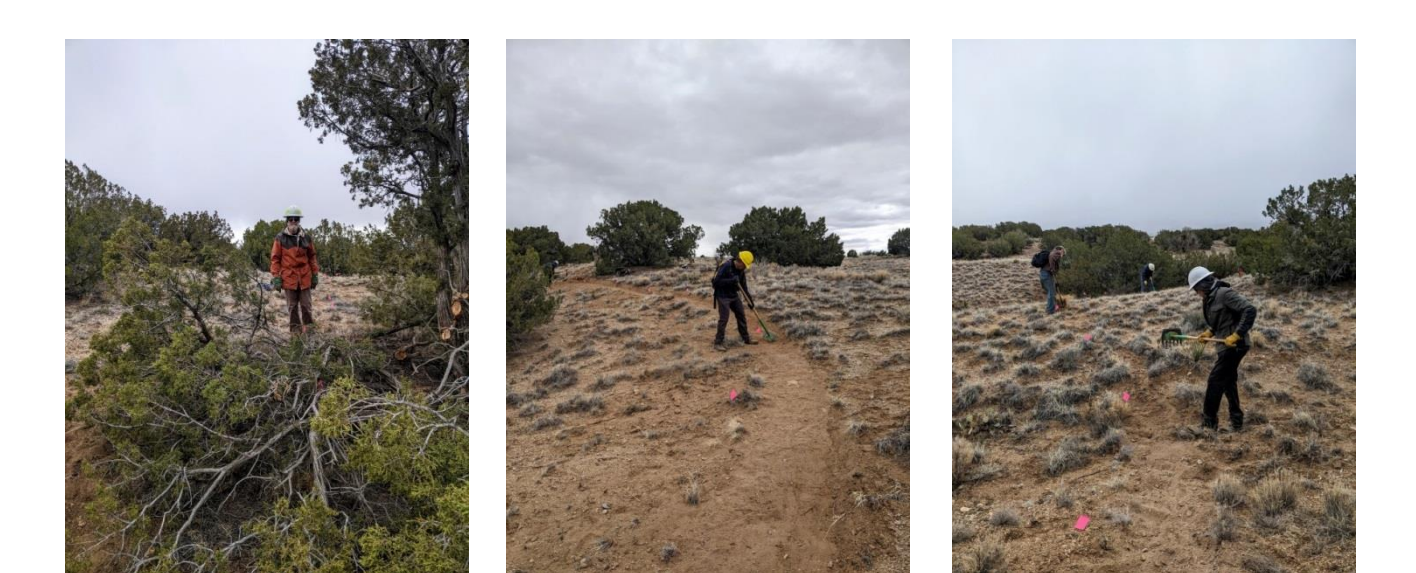
Cleve ponders some strategic swamping