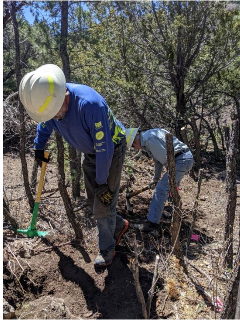
Jim tackles a “rockberg”