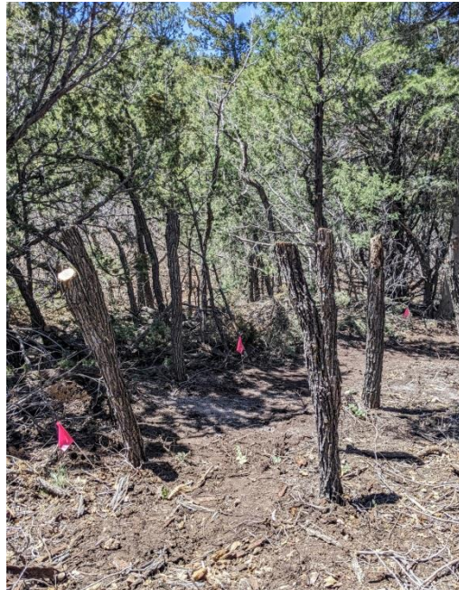
A little later... progress!

(Oaks are left “high-stumped” for better leverage when pulling them out)