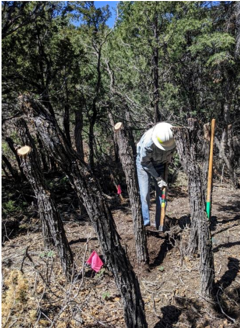
Byron tackles Stonehenge