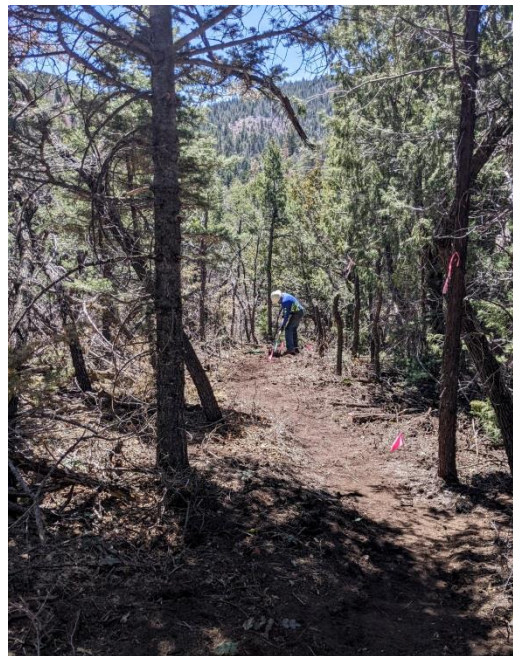
During & After