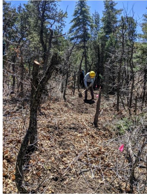
During (from farther back)