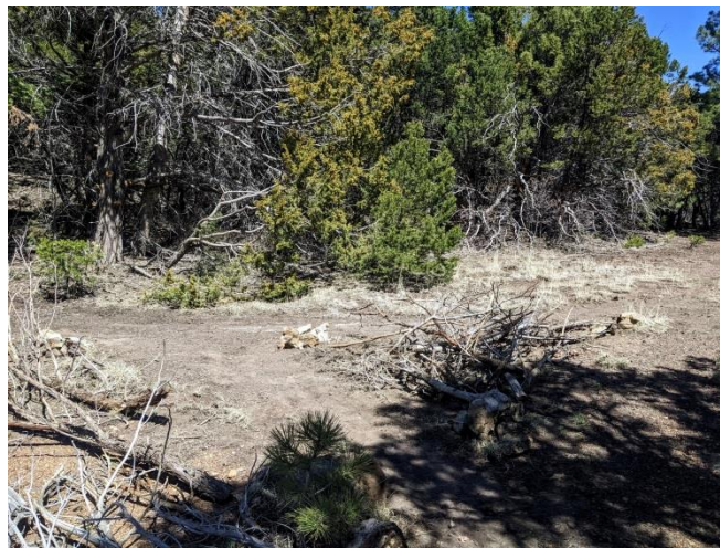
The completed triangle junction where the reroute meets the North Mystery Trail (Faulty Trail)

(Not pictured: volunteers used dead branches to close off/obliterate a long section of the old trail when the corresponding rerouted section was complete)