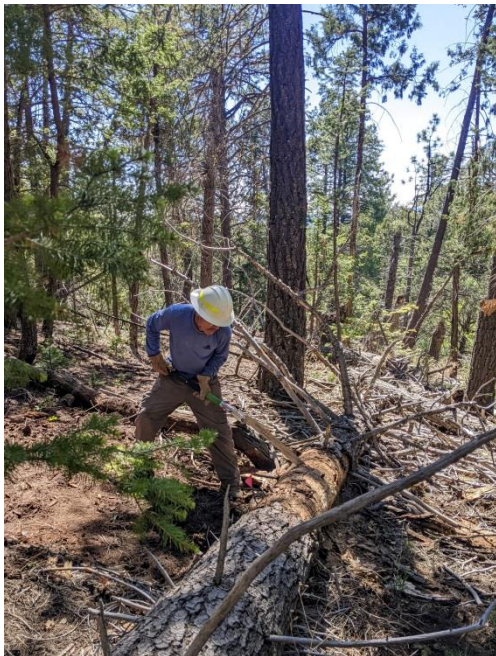
Plenty of saw work needed