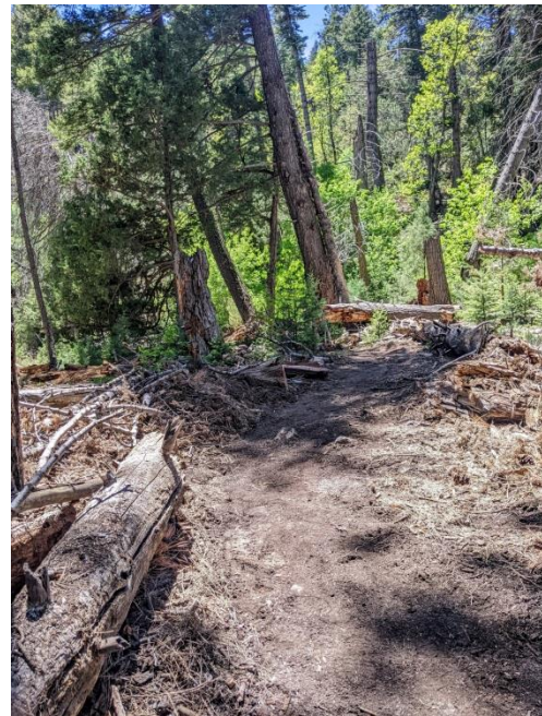
After (from closer)