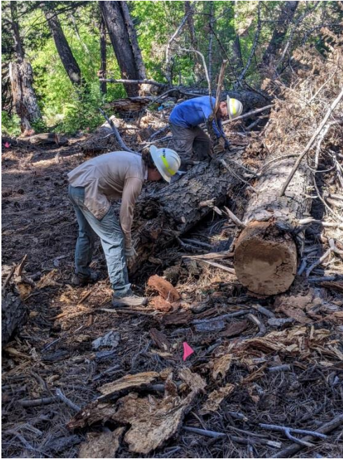
The flagged line went right through this debris field