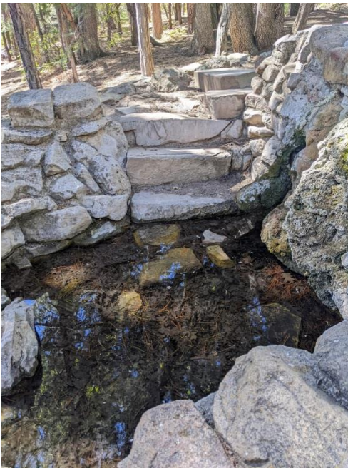
With special permission we camped at Cole Spring, still with a trickle of water