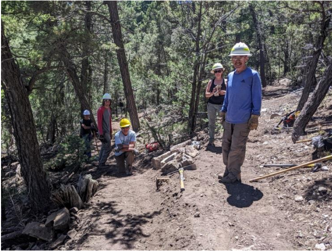
The new junction with Cañoncito Trail (looking west)