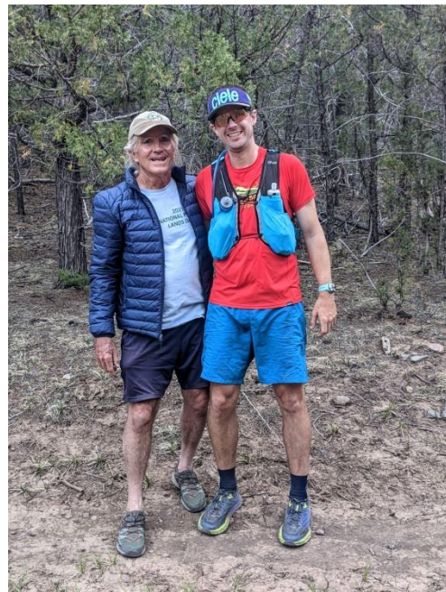
Look who we ran into on the Faulty, just up from Cole Spring! 56 miles into his run.