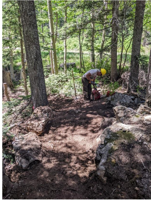
The other rocky section. Before (again) and after.