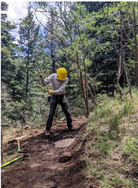
Sim swings a sledge