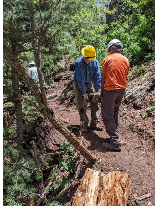
One of many!