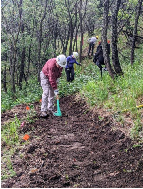
A Pulaski or boot can be used for grading too (Ed, Courtnee)