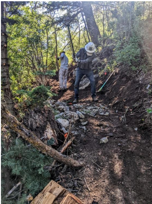
Bruce turns rock into “crush,” to bring up the level of the tread