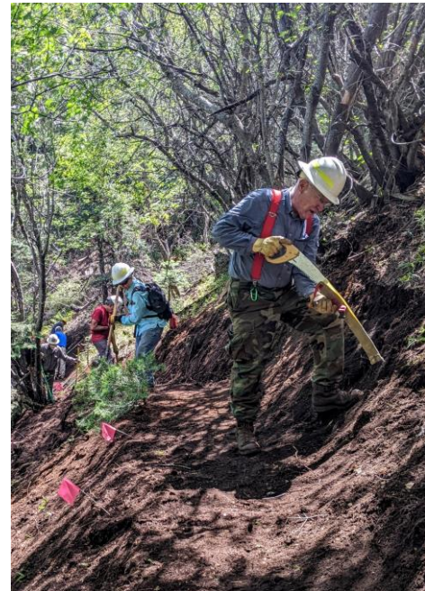
Team Nicholson & Co.