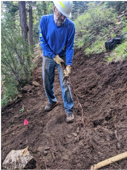
Jim uncovers a root