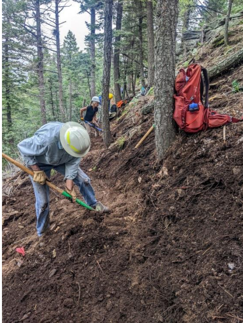
Byron and Claudia move a (unprintable)-ton of dirt