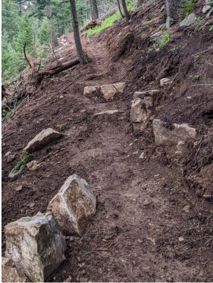
A bunch of before- and-after shots from the last few weeks...