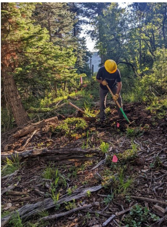
Roland gets started, removing the top masticated layer.