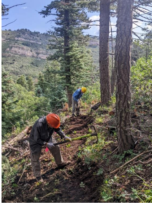
Don and Eric round the bend. The trail will have some views!