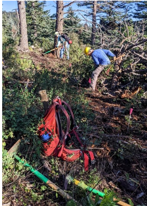
Ralph and Rav tackle a section with some oak