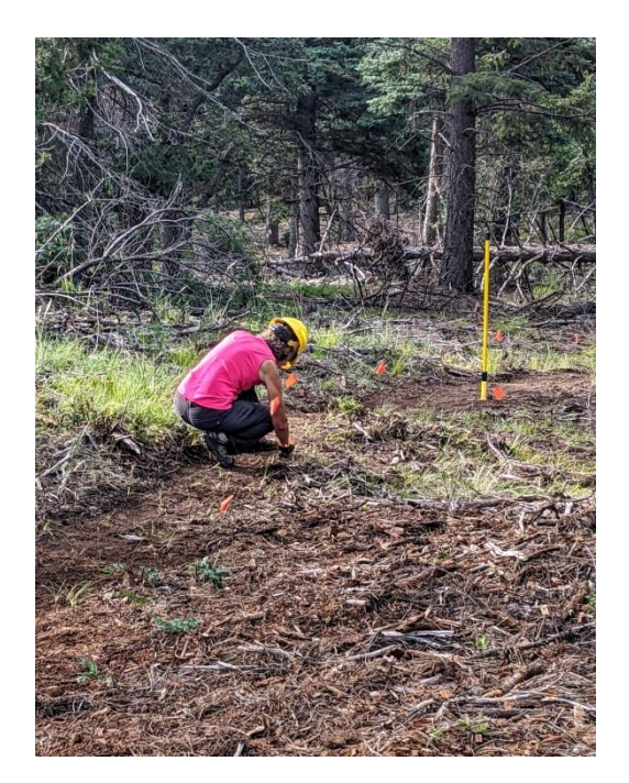
Pat attends to the details in her section