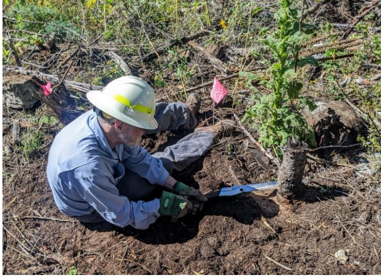
Cleve opts for low-stumping here. Wise move.