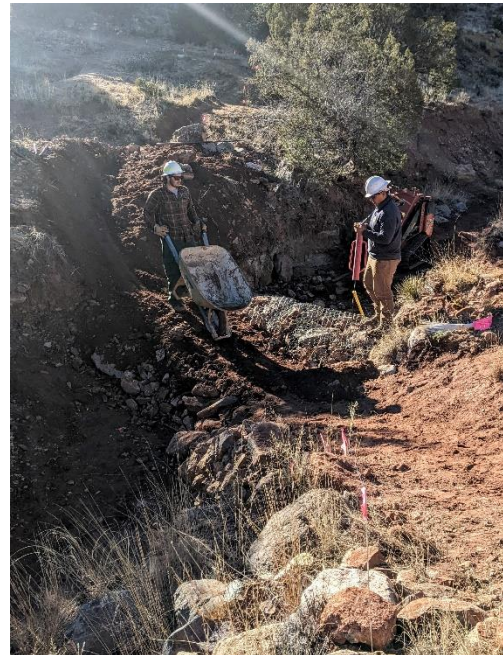
Now for the fun part, loads and loads of rock and dirt to build up the new tread behind the gabions.