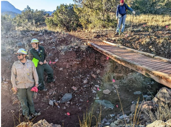
The south bank. Note the line of pin flags marking where the trail will go. Trail users continue to come through throughout the workday, so bridge removal needs to wait until new tread construction is complete.