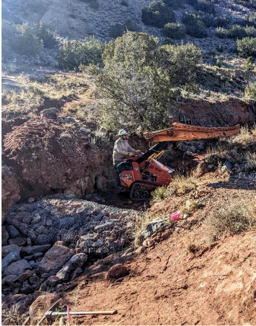
With the second gabion in place the bridge can be removed! Go Russell! We'll just set it over here for now...