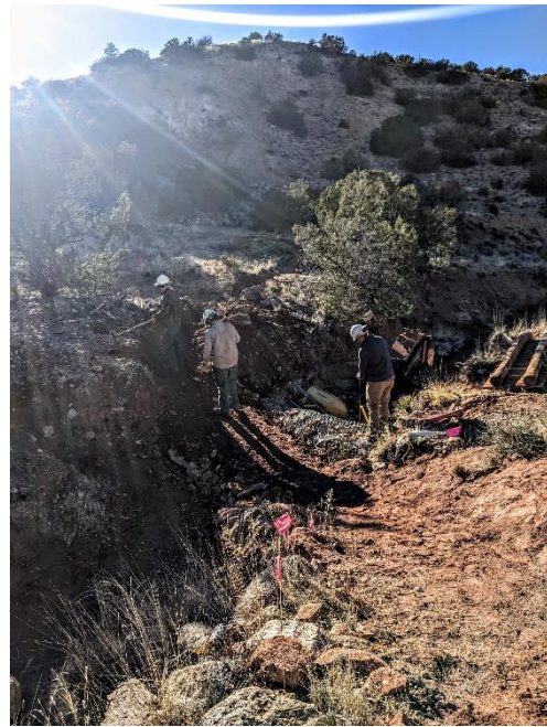
Before, in the AM, and After (close to completion) in the PM. Rideable!