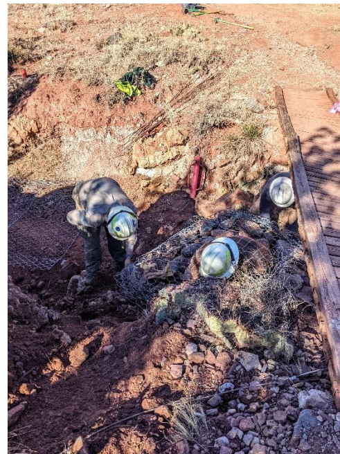
The FS crew closes the cage