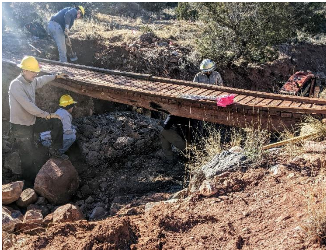
Volunteers used a bucket brigade, tossing large and small rocks into the (well-placed) cage to build the first gabion. Eric kept plugging away... (Eric, Roland, Joe, Russell)