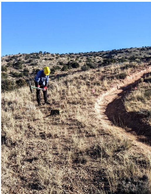
Larry works near the old trenched-out trail. The new trail will cross it.