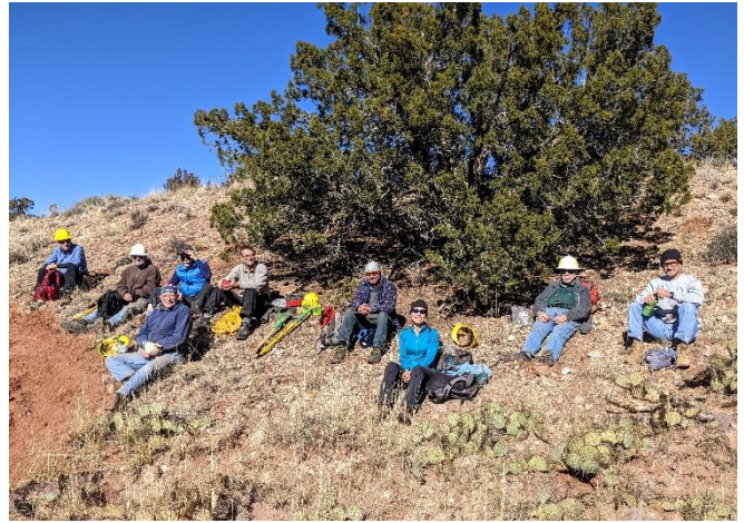
Lunchtime! A beautiful bluebird day.