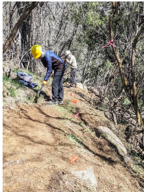
Pat's section takes shape.