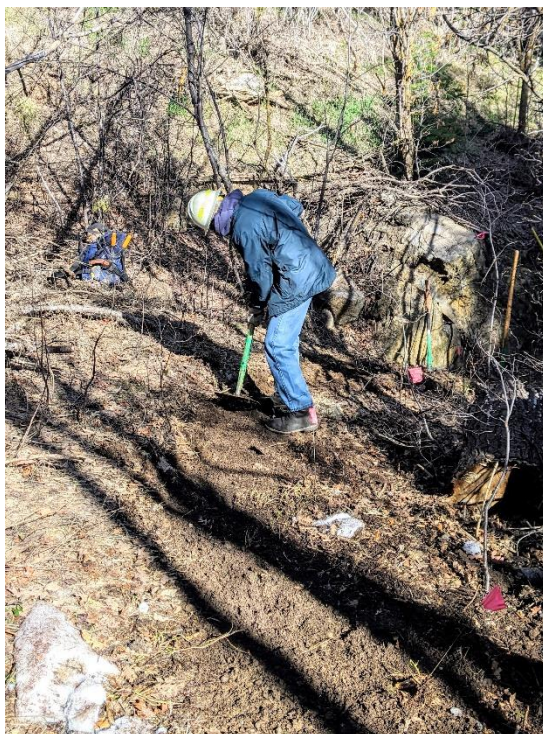
Byron bundles up (note the snow)