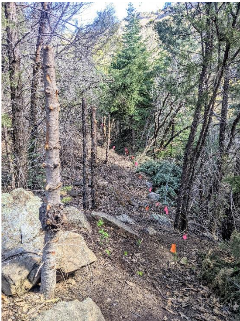
Before: high-stumps; cut branches on the downslope; no tread