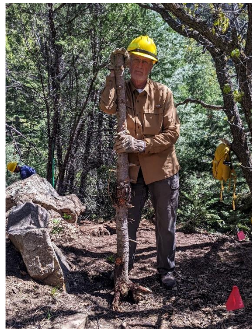
After – no longer the case

Stumps are usually completely removed, vs. low-cutting, since the soil can wash away over time, leaving low stumps exposed.