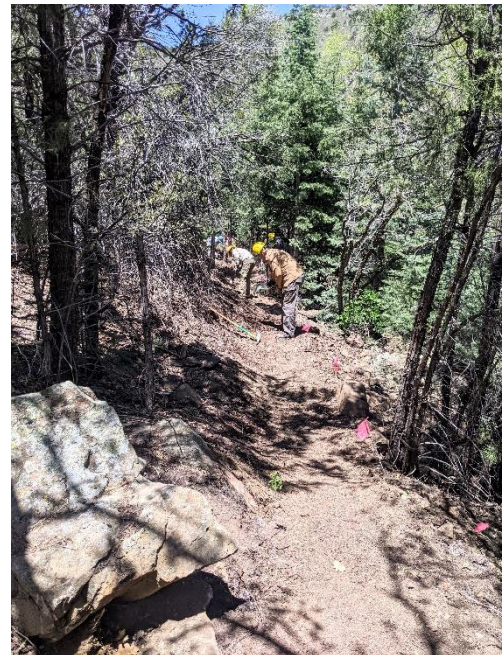
After: stumps and branches removed; brand new tread