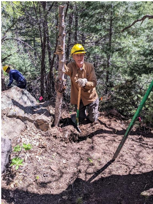
Before – in the ground