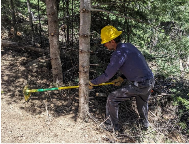
Roland wraps it up