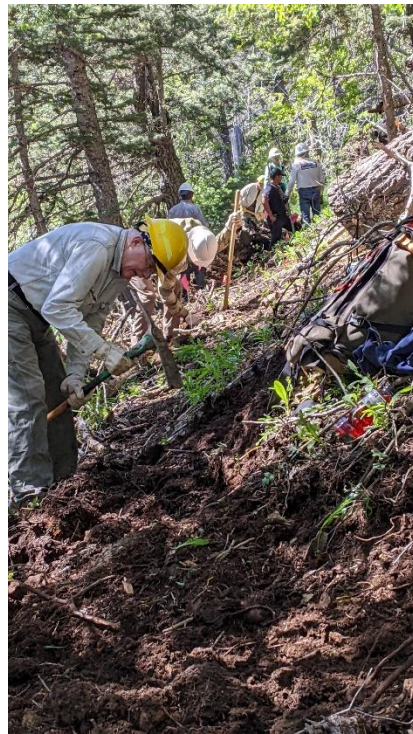
That's better