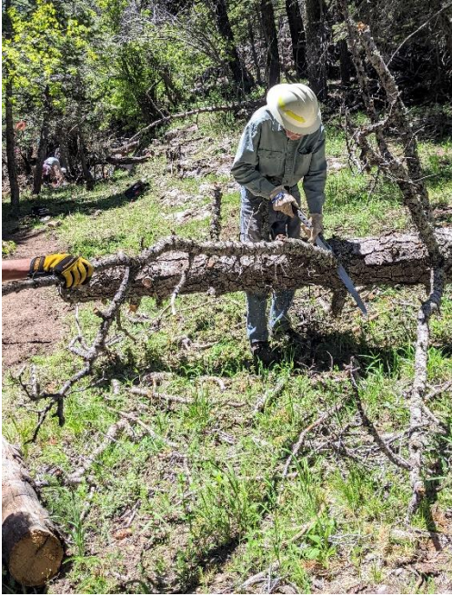
Byron removes a limb which encroaches on the new trail

Later, some of the FOSM crew jump ahead to work on the flats