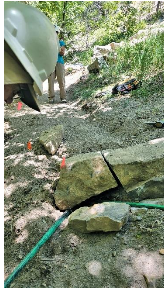
Luckily it had a crack