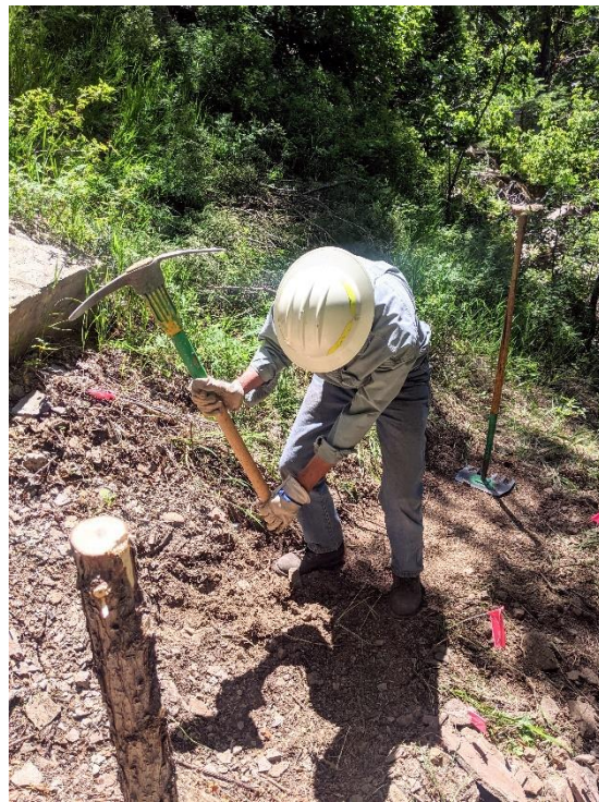
Byron on the chain gang