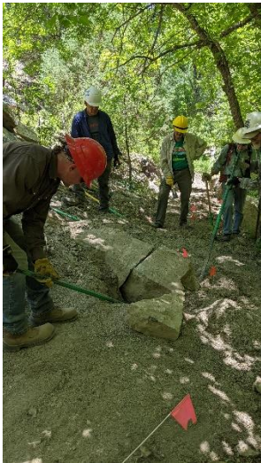
Taking turns. One rock bar.