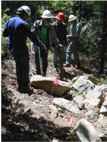
They dubbed it The Monolith