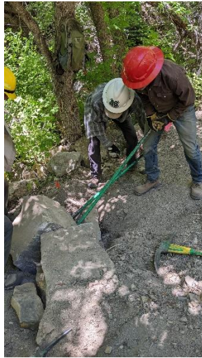
Two rock bars.