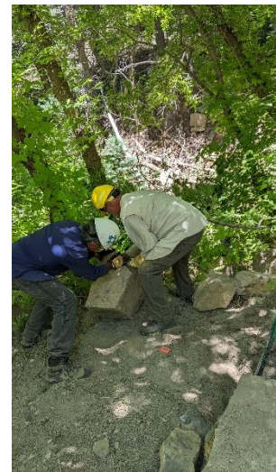
Roll it away. Now for the bigger piece...