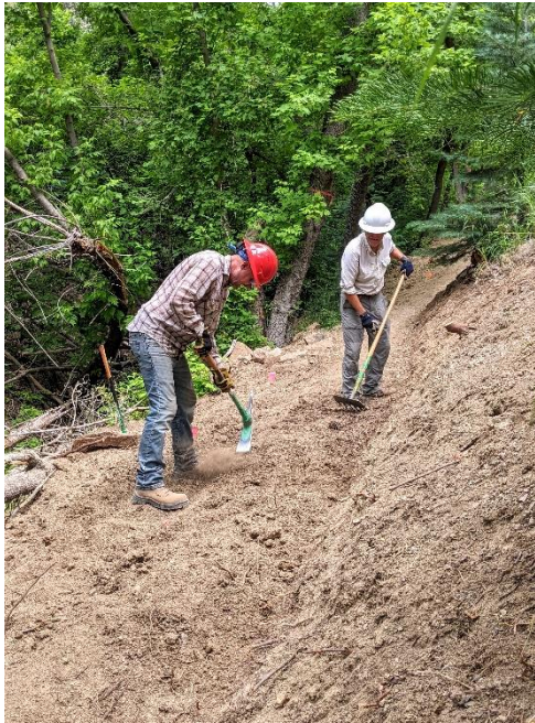
Tayo and Bill widen the tread to provide a good base for horses and bikes (Tayo is standing off the trail)

Finish-work: the seemingly never-ending quest to make sure the new tread is sustainably built, to hold up over time