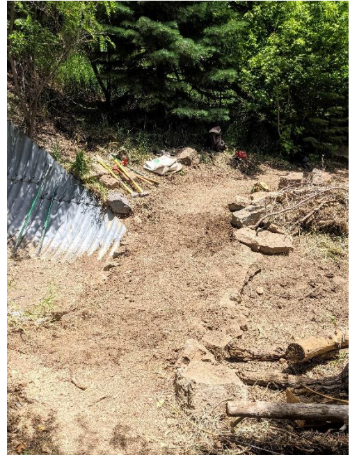
After: a nice smooth in/out for trail users. Water will pass through the base layer.