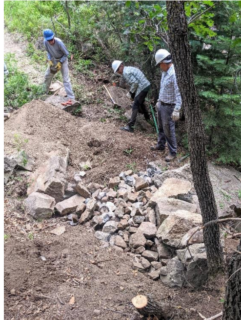
Later-during: the crossing starts to take shape. Note the retaining rocks at the bottom edge.