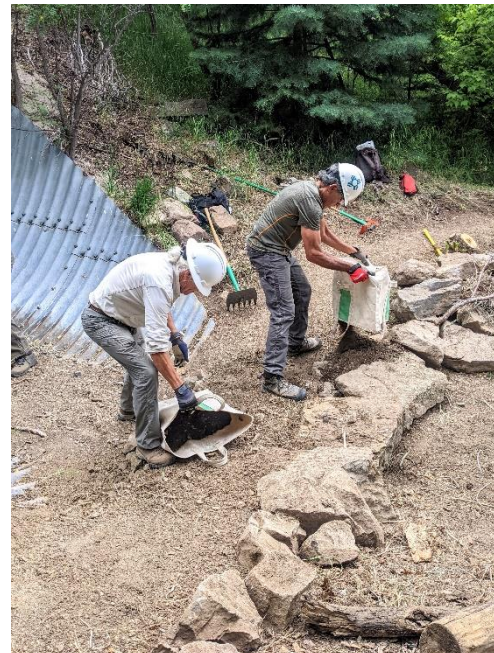
Do you think they're counting?