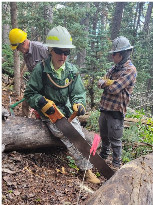
Rav brought a crosscut saw