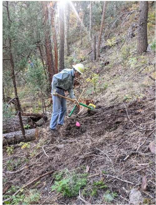
Byron does some clearing too, before diving into tread work.

Plenty of duff! The crew starts mostly with McLeods.