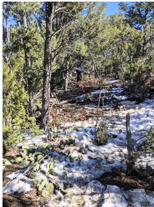
Done. Ready for tread construction when the time comes.