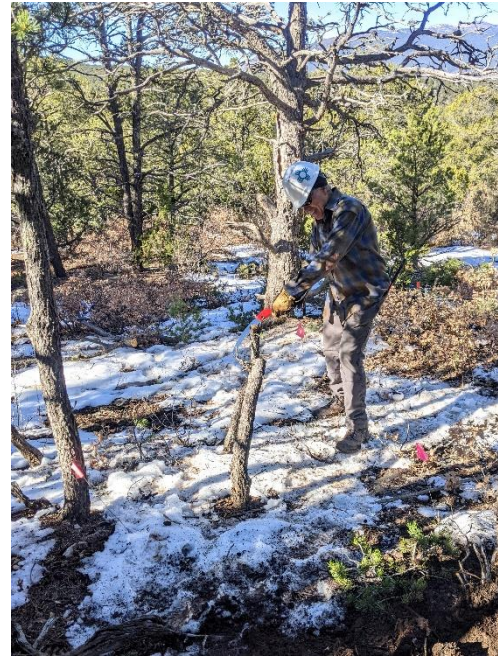
Luis helps the photographer

High-stumps are left for leverage when removing the stump roots later.