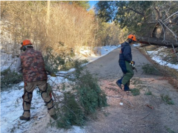
Left: Dan Benton waits to remove debris while Jerry continues to buck tree. Right: Dan removes debris from road.