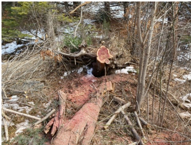
Stump and root ball of largest tree after bucking.