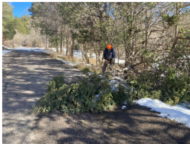
Jerry clearing the smallest tree from the road.

The removal crew then moved further up the road to remove the smallest of the three trees.