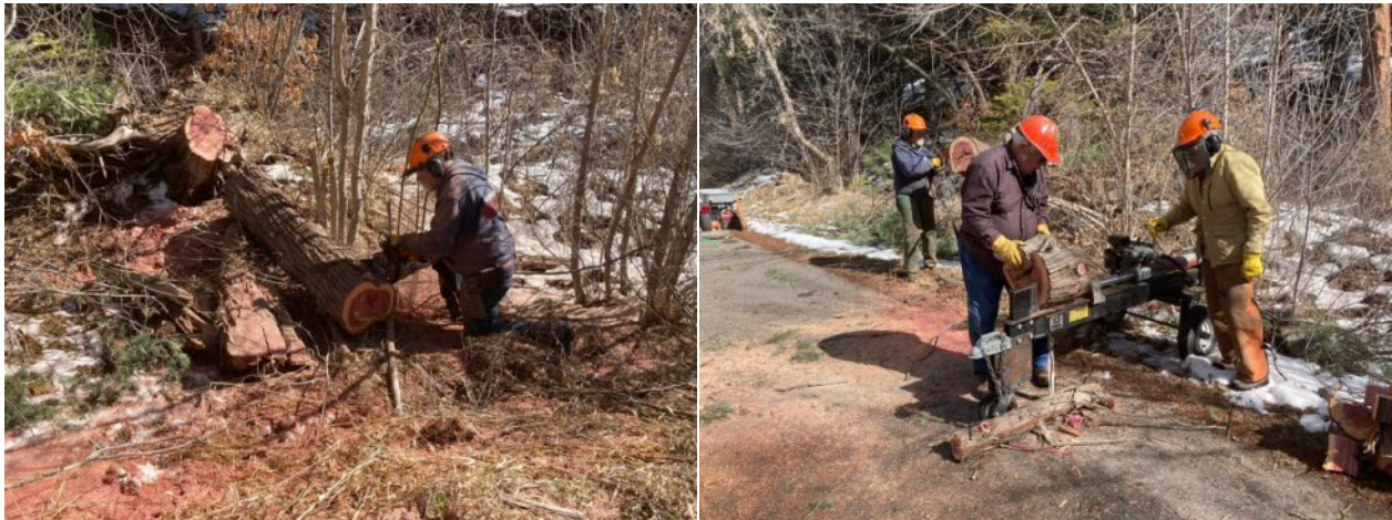
Left: Jerry bucking trunk of largest tree. Right: Lou and Don splitting rounds from largest tree.

The removal crew then moved back down the road to buck and split the wood from the larger of the three juniper trees.