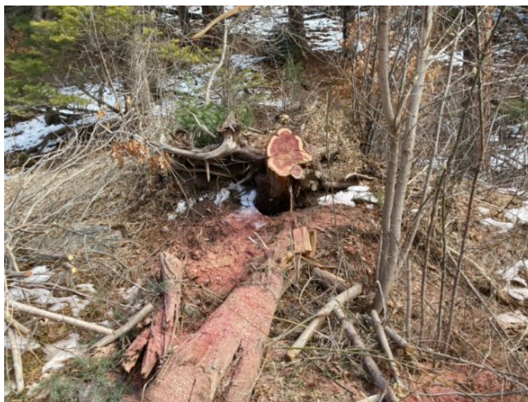
Stump and root ball of largest tree after bucking.