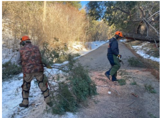
Left: Dan Benton waits to remove debris while Jerry continues to buck tree. Right: Dan removes debris from road.