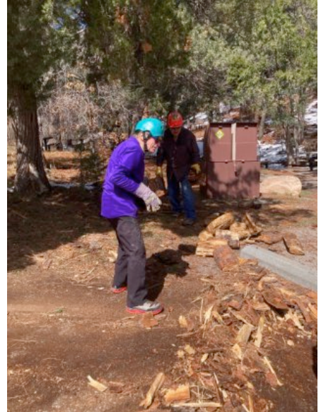
Left: Two trailer loads of wood in church woodlot.