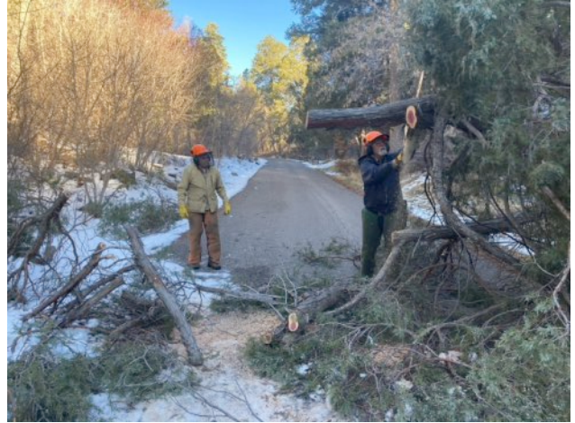
Left: Larger fallen tree across Cienega road. Right: Jerry bucking tree while Don Carnicom waits to move debris.