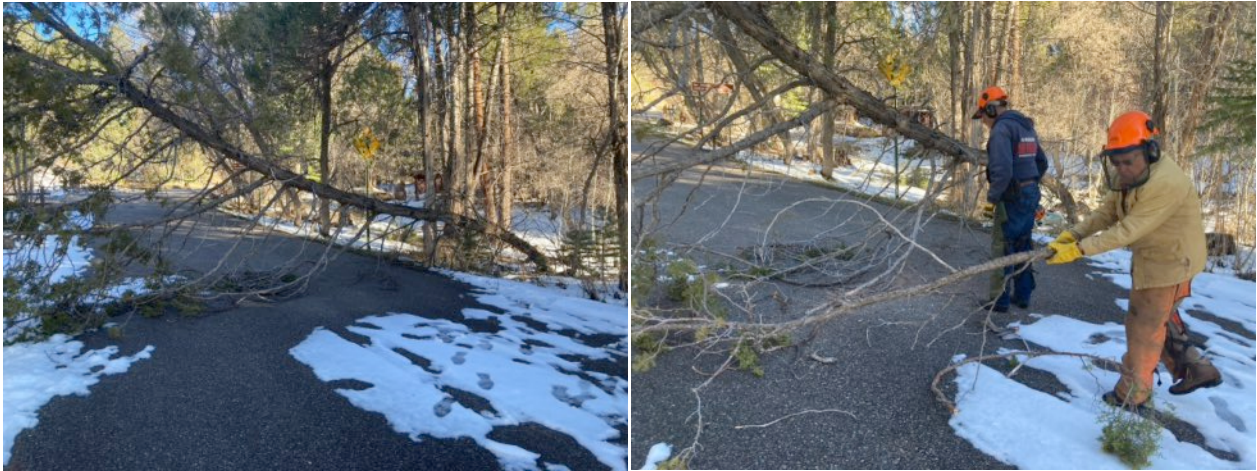
Left: Middle-sized fallen Rocky Mountain juniper across road. Right: Don removing limb cut by Jerry.

The removal crew moved up the road to clear the middle-size fallen tree.