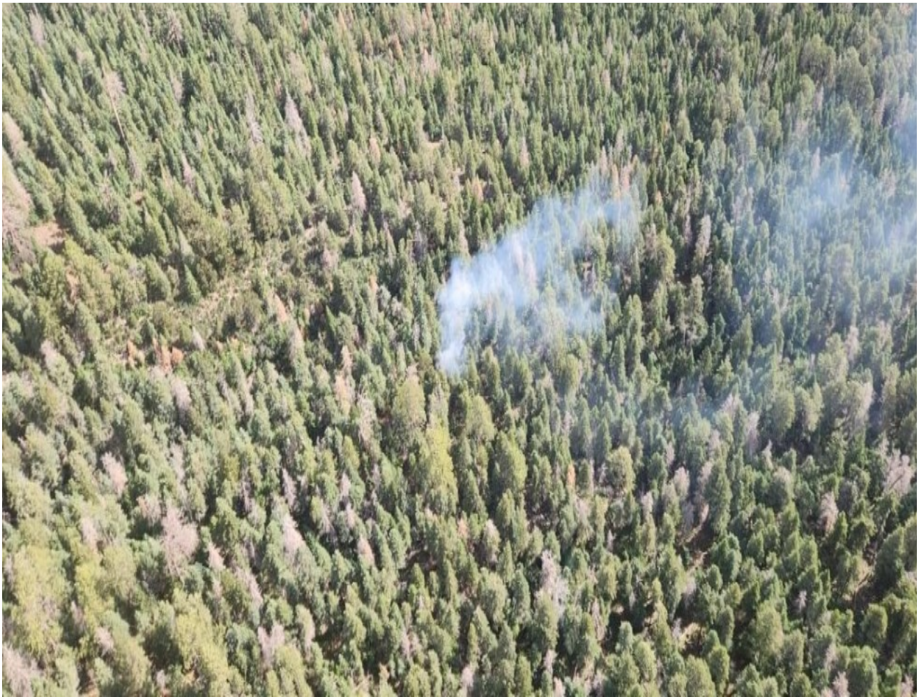
Photo: Forest Service photo taken on June 28, 2024 of the OSHA Fire within the Sandia Mountain Wilderness on the Sandia Ranger District of the Cibola National Forest & National Grasslands