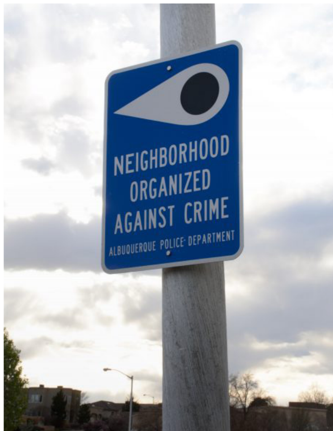
Neighborhood Watch photo courtesy of Ricky Garcia, New Mexico News Port. Used with permission.

The unique needs and resources of each neighborhood will determine which of these options may be right for any particular association.