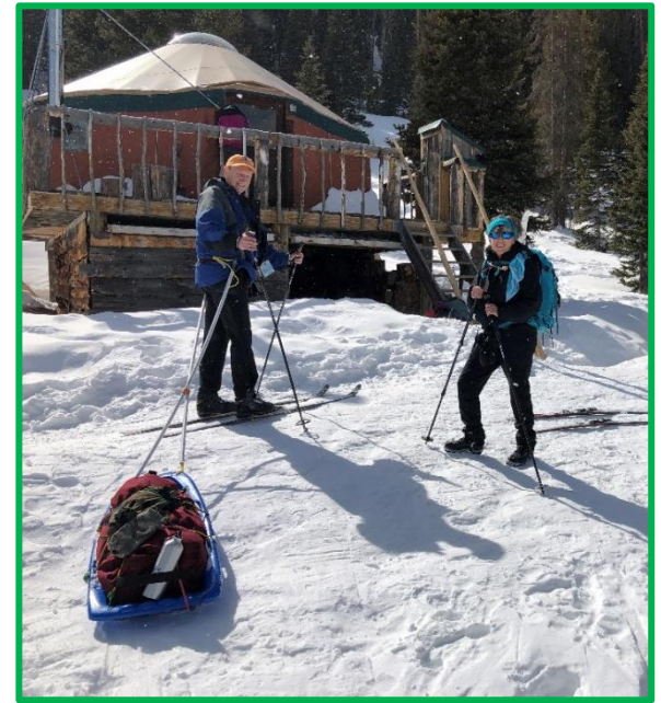
Banca Peak, Birdeyes view from the skylight, Sunrise, Pulling the sled, Home