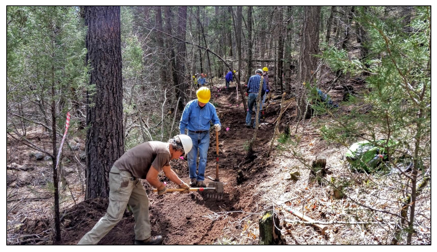
The experienced FOSM crew cuts in the tread. Soil conditions were perfect for building trail.