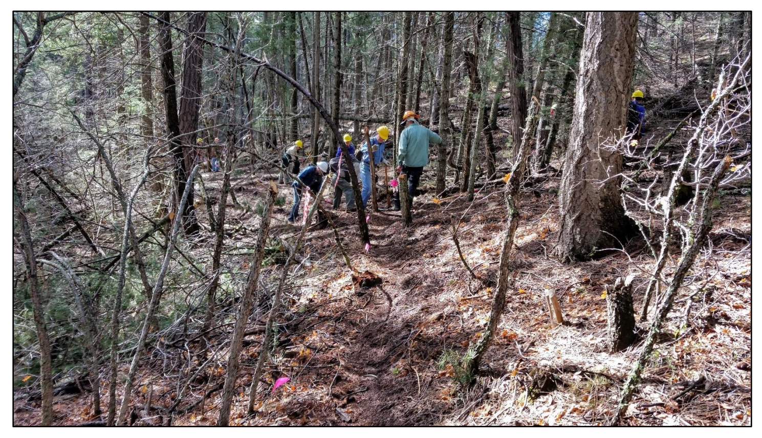
A LOT of hikers have been using the new trail corridor so a tread line was quite apparent.

Big crew today. Listen up! The boss administers the safety briefing so everyone is on the same page.