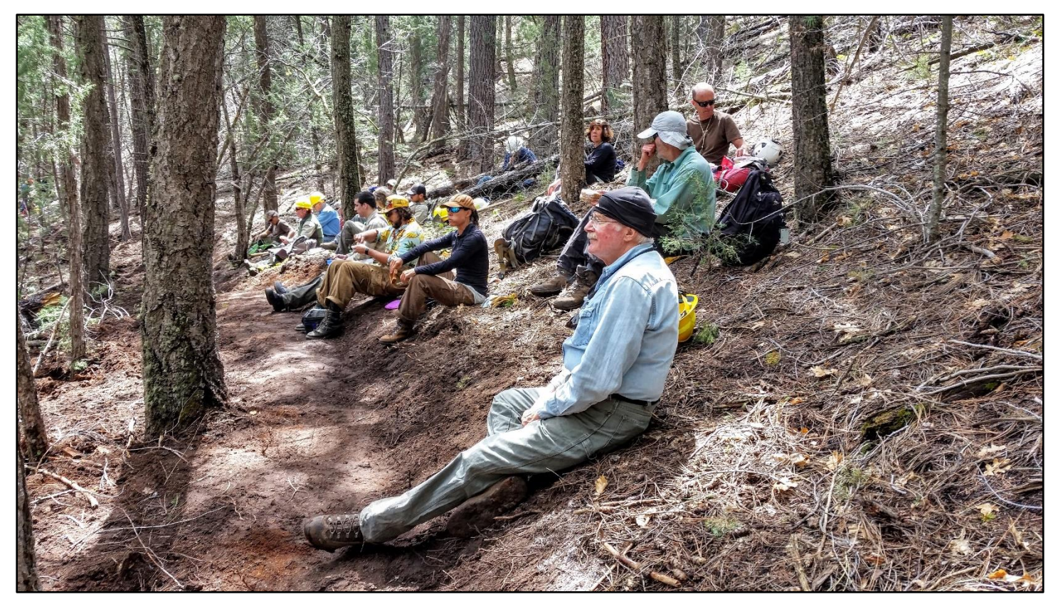
Ah, lunch, finally. And yes, it is always hard to get started back up again afterwards.