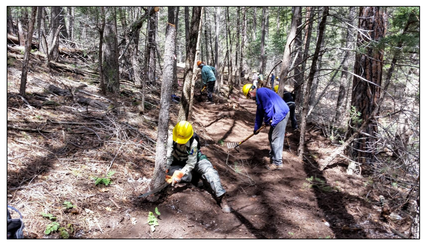
The final line missed a few stumps which luckily could just be low-stumped.