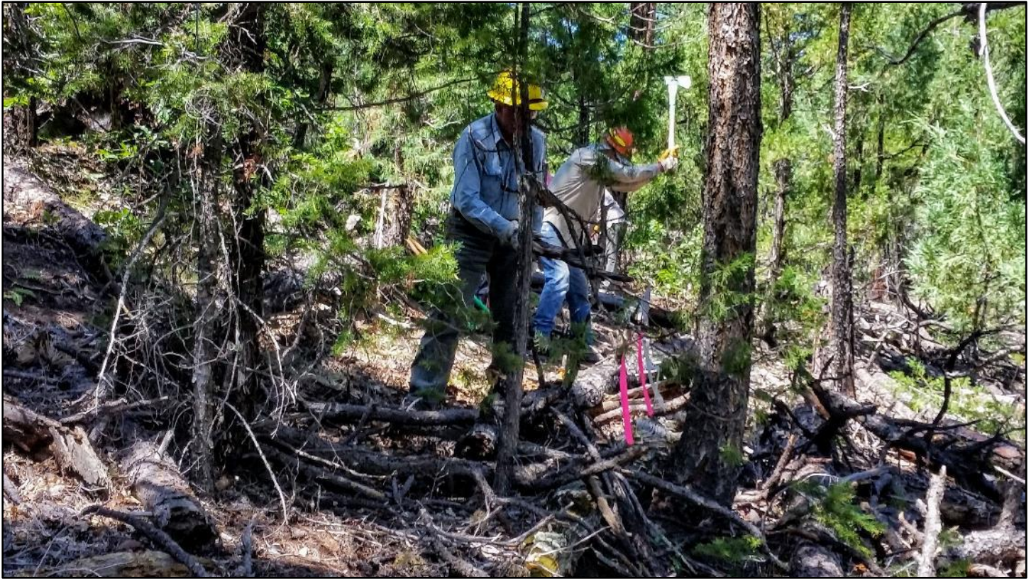
The deadfall came in all sizes and just took a lot of hacking to get through.