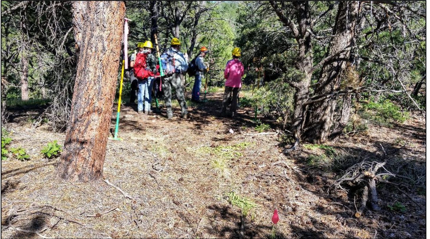
The crew is at the start of the upper reroute. The soon-to-be bypassed trail is to the right