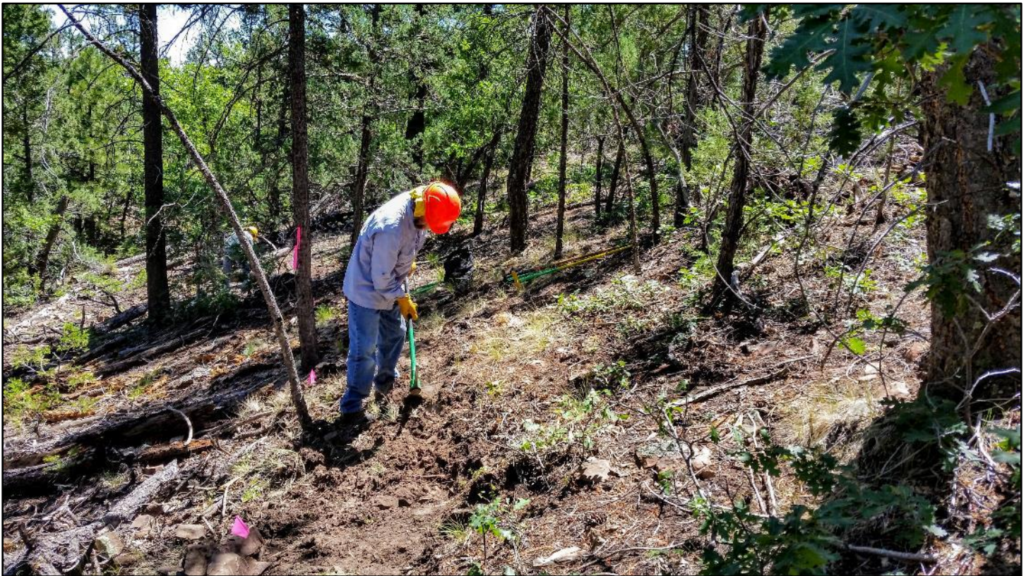
After lunch the crew started feeling the heat in the sun. But it is a dry heat. Yeah, right...