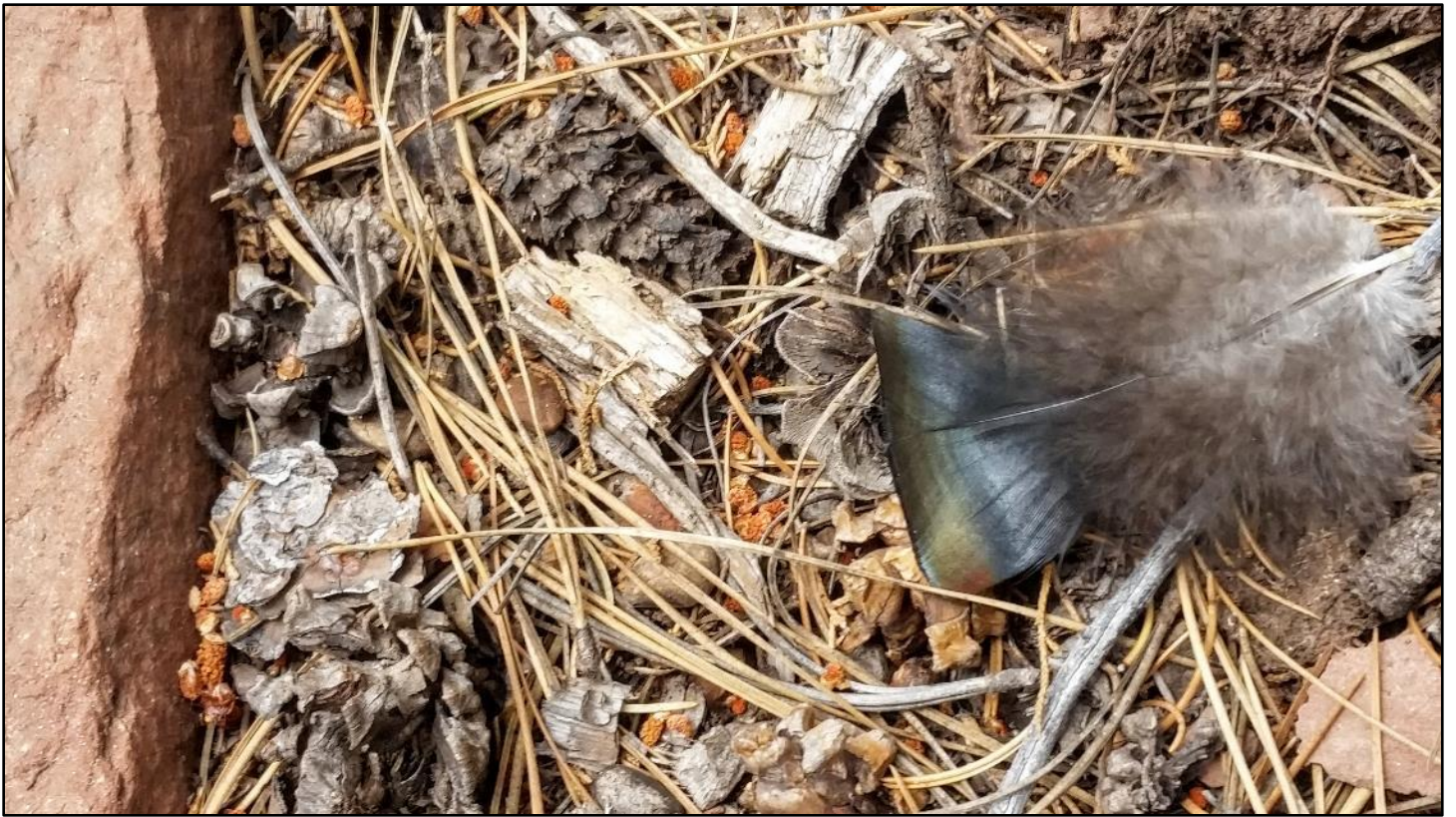
Evidence the Sandia wild turkeys were surveying the trail line before we got there.