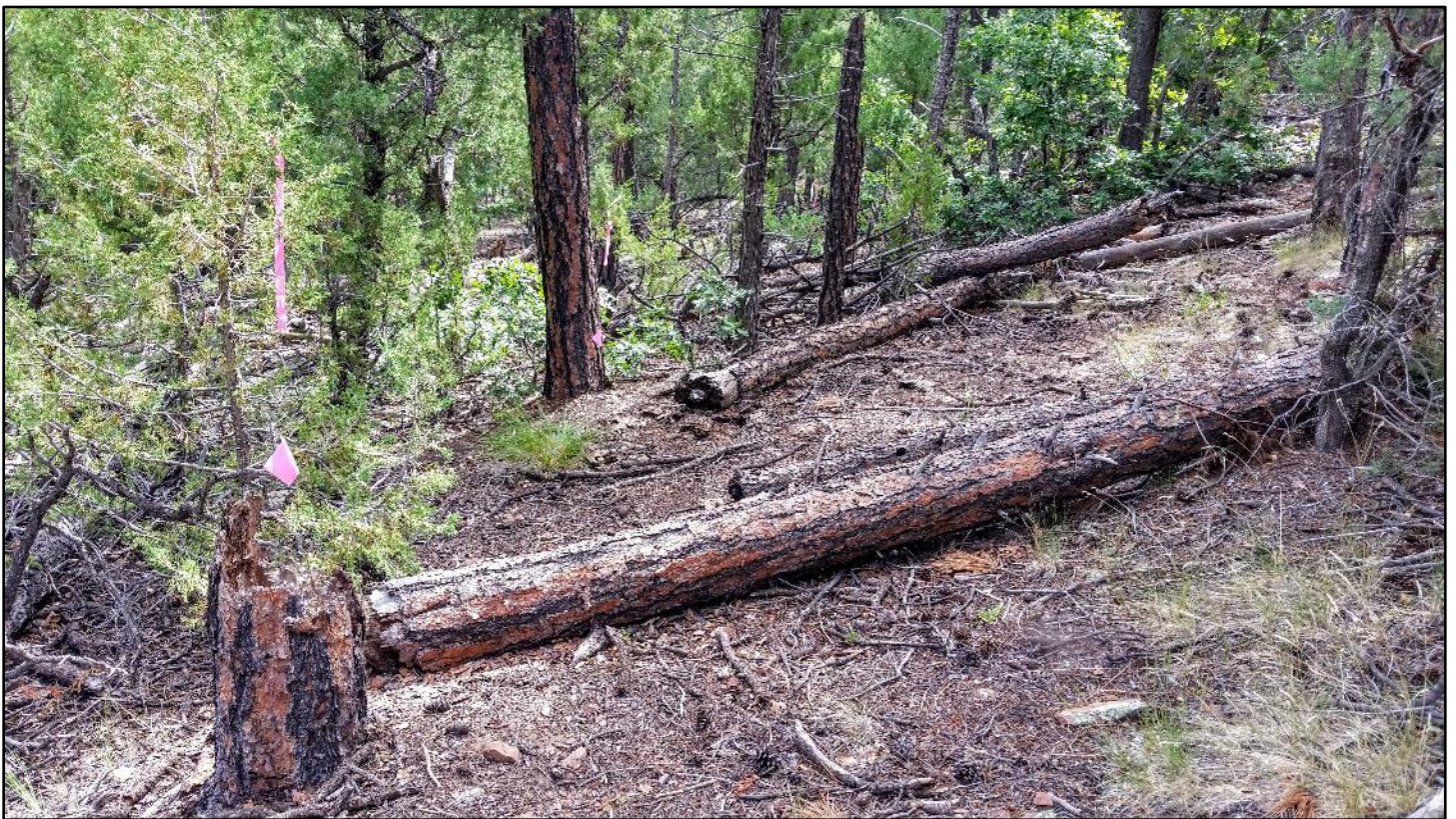
Before: The lower reroute, Section TC03, was a tangle of ponderosa deadfall.