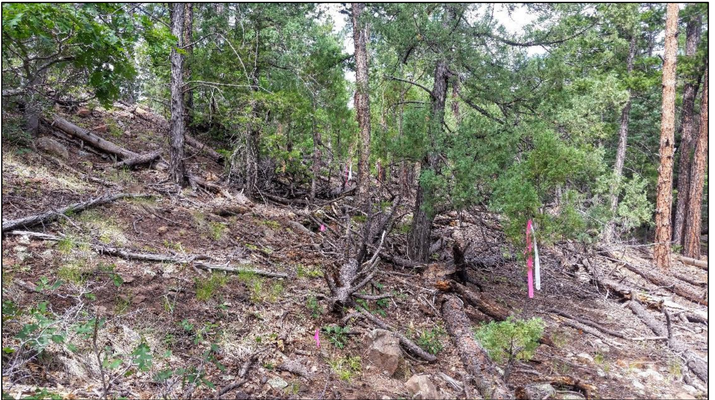
Before: a lot of ponderosa deadfall had to be cleared out just to find the dirt.