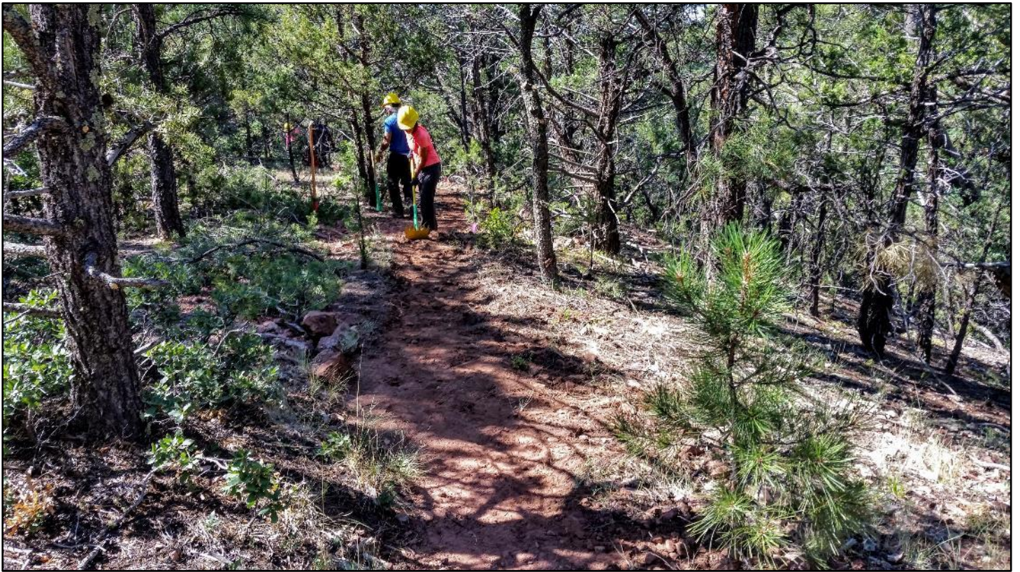
At the top of the reroute, the new trail follows the terrain contour. The old bypassed trail is to the left.