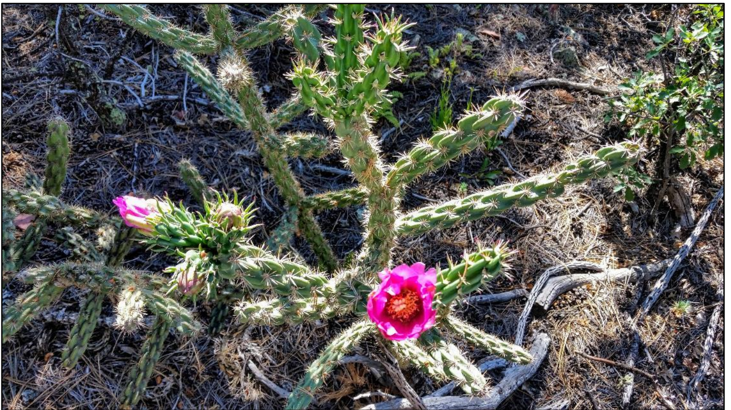
Wildflower of the week. With the heat, the cholla cacti are showing their color.