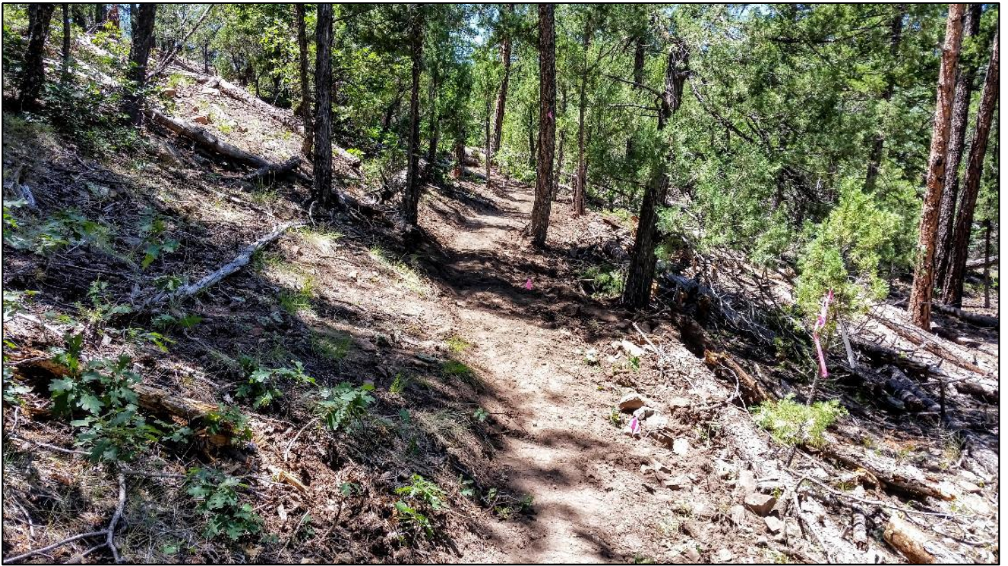
After: With all the debris finally cleared, the trail tread was cut in.