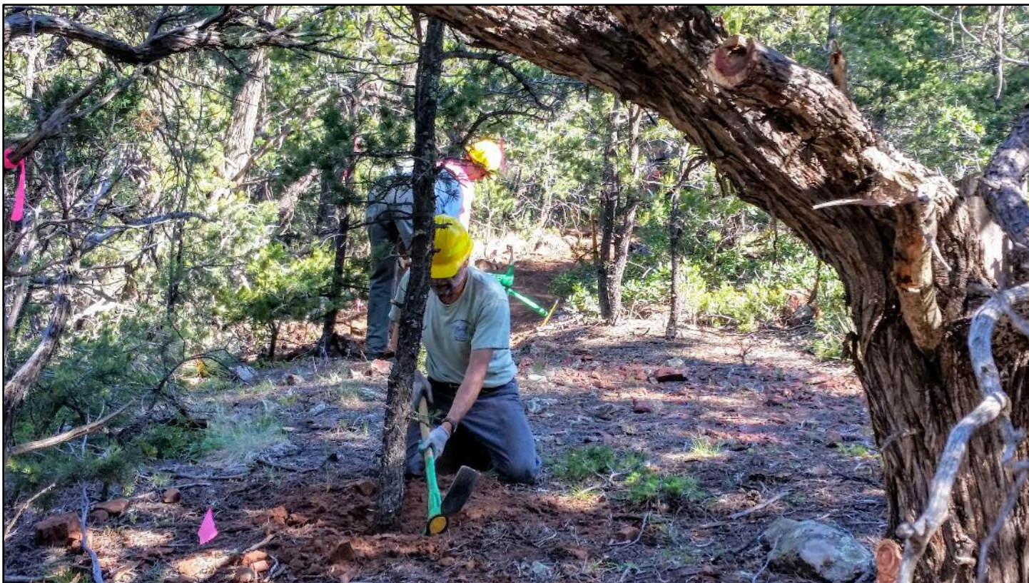
Of course there is always a tree right in the middle of the new tread to dig out.