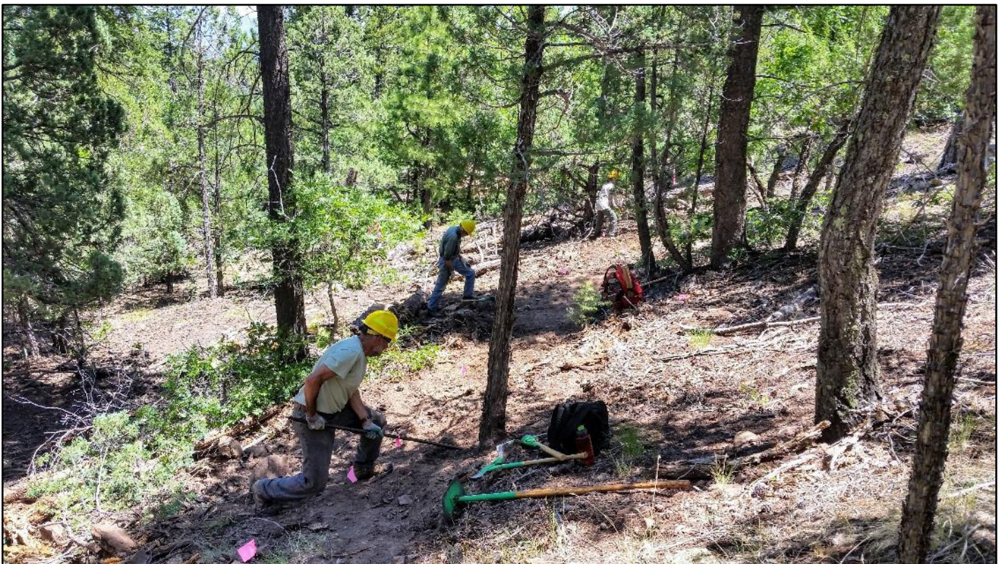
End of the session. Working on another dig-out. We'll pick up right here next week.