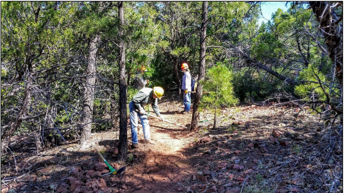
Above the reroute, the corridor was opened up and loose rocks were removed from the existing trail.