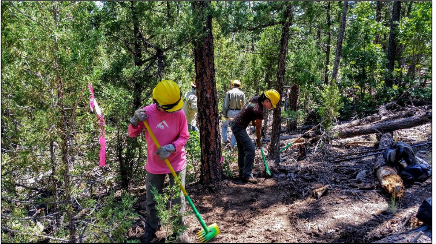
The crew jumped the log and started cutting tread on the lower reroute.