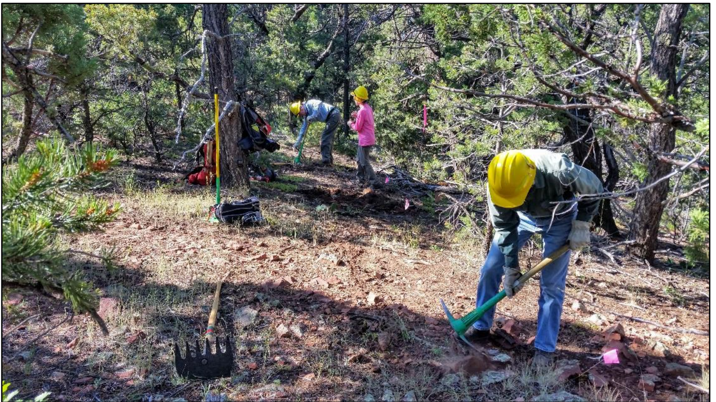
The crew built the upper reroute pretty quickly, including cutting the trail corridor.