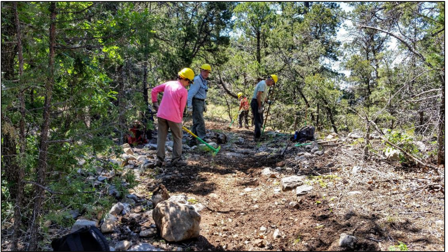
Below the upper reroute, the crew did some grooming of the old trail on their way down.