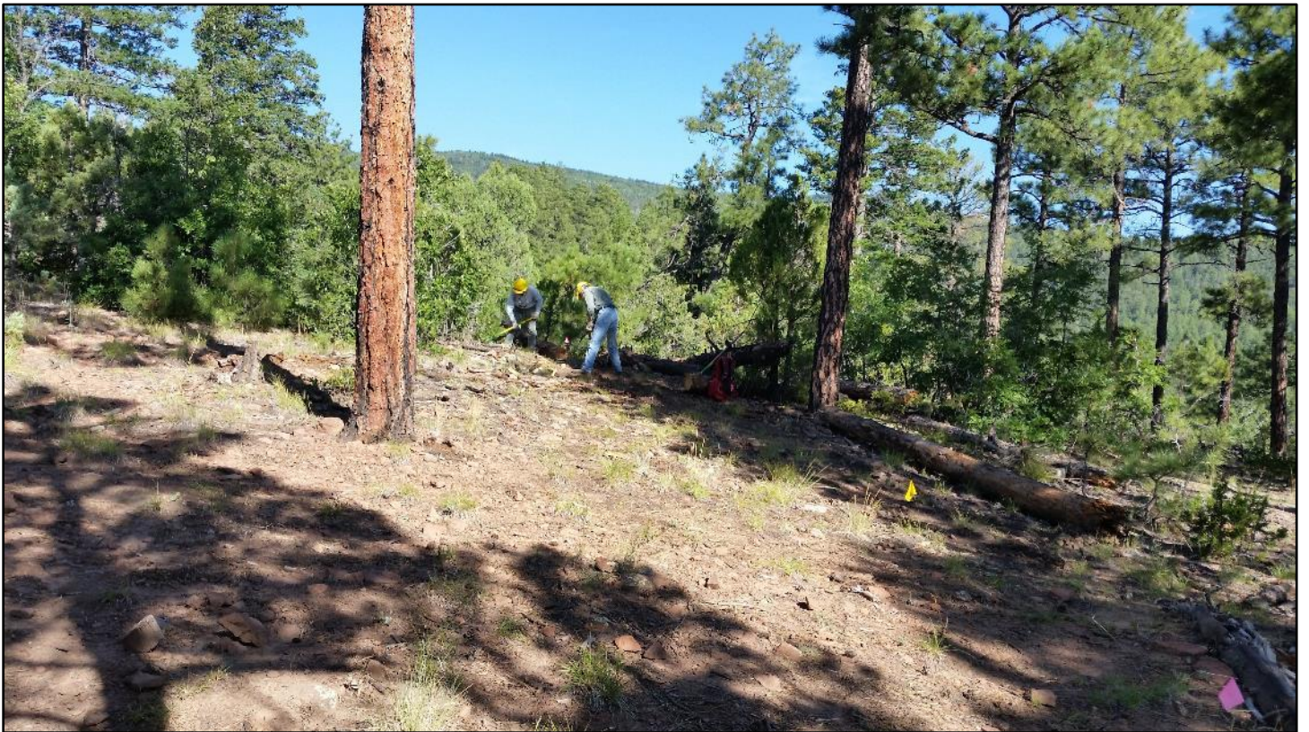
These two guys cut in the lower connection of Section TC03 on Madera Locura.