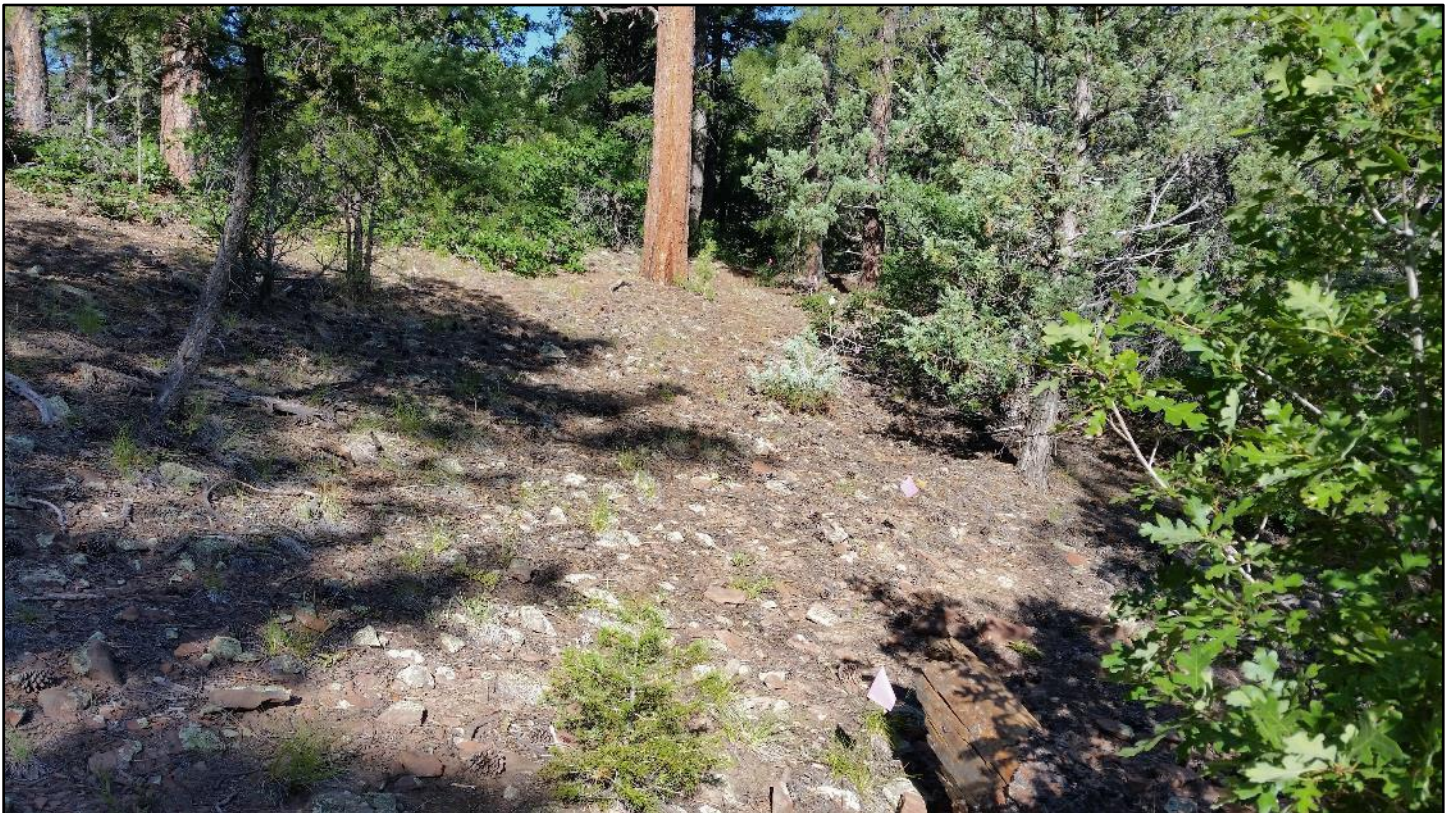
Now let's cut in the upper connection to Reroute TC03. Get er' done!