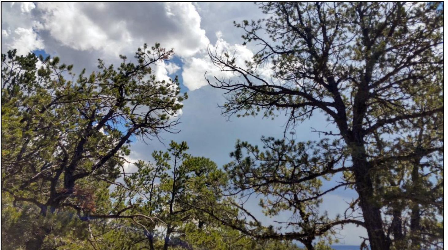
Sitting down to lunch, clouds started building, thunder started booming, so we quickly headed home.