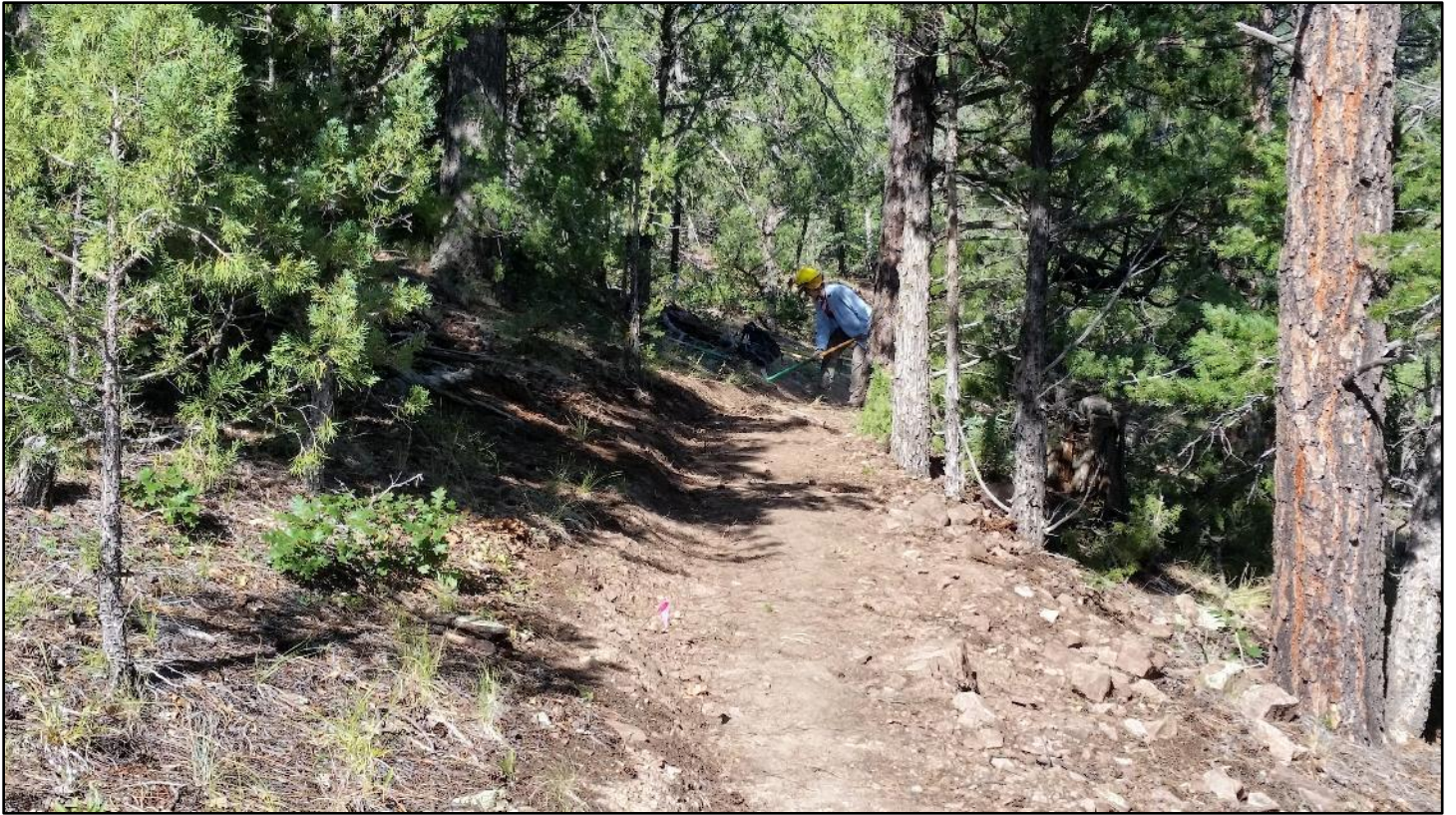
There is always plenty of detail work needed to complete new trail.