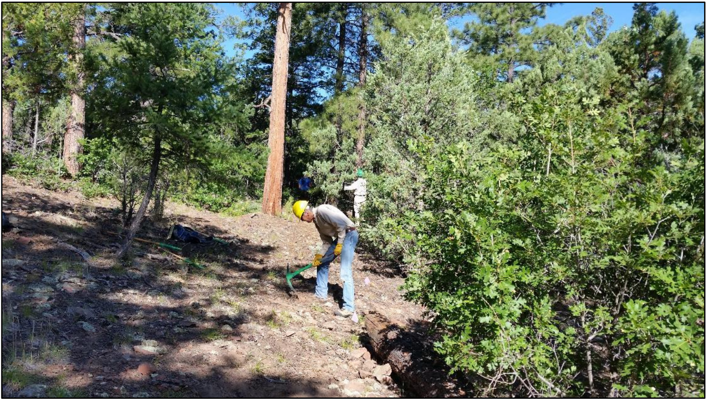
Part of the crew pitches in on the upper connection and opens up the trail corridor.