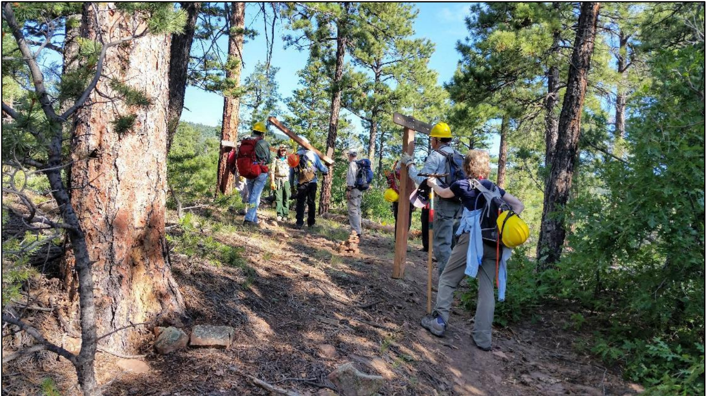
The crew arrives at the work site. Mostly uphill, carrying trail signs, we're tired already!