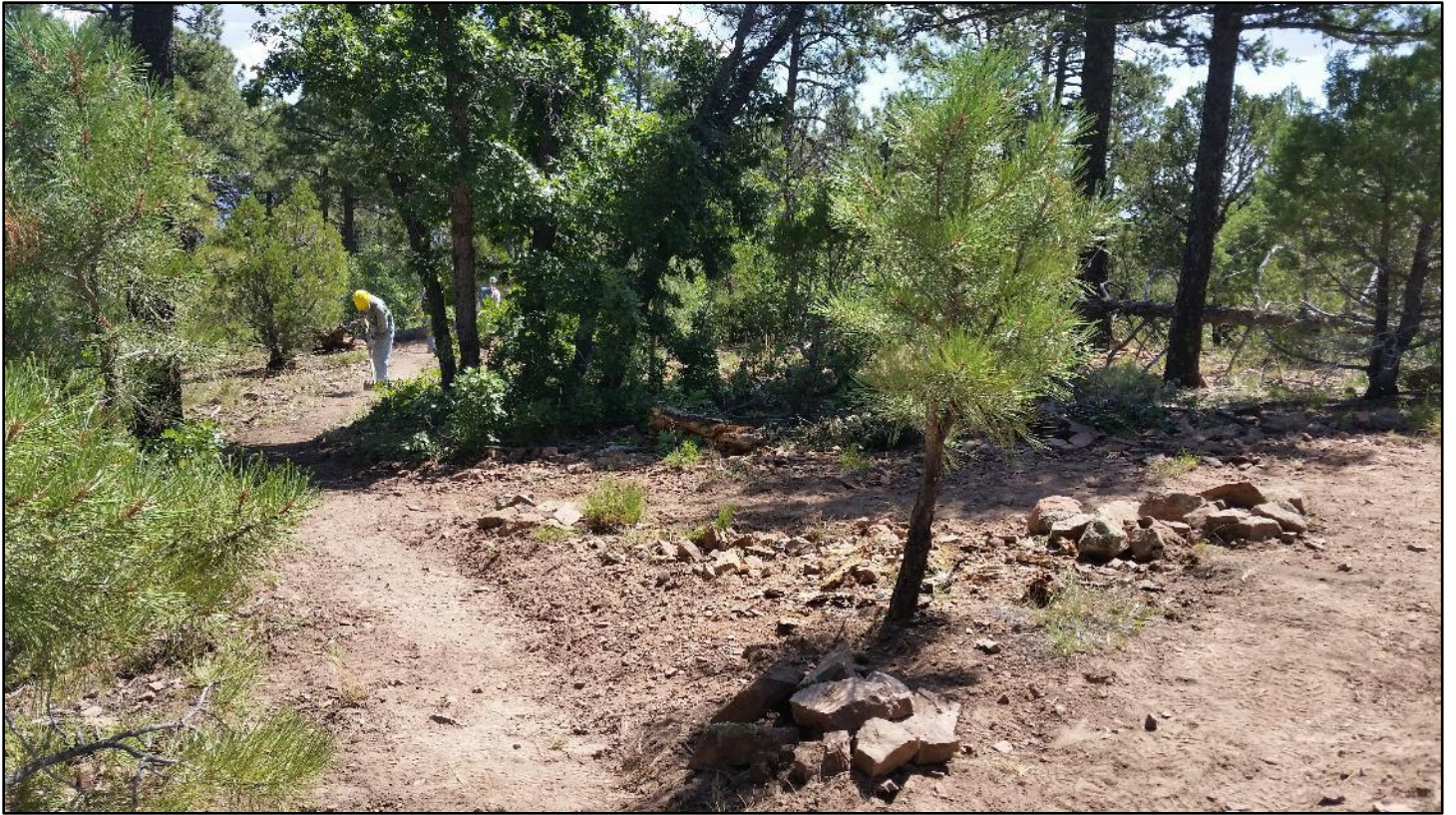
Elk Track comes in from the right to Madera Locura. Now we just need the trail signs.