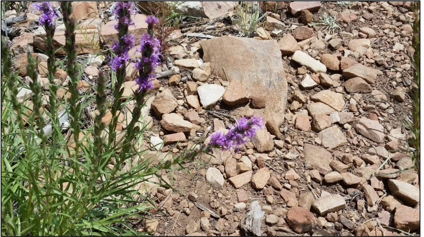
This week the dotted gayfeather started blooming.