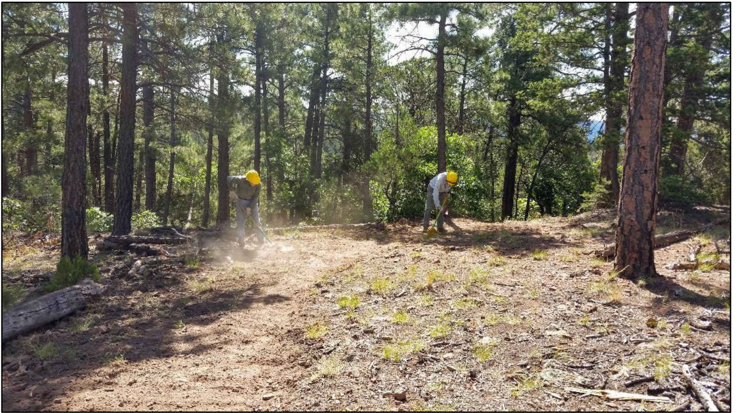
Final grooming on the lower connection. Making the dust fly.