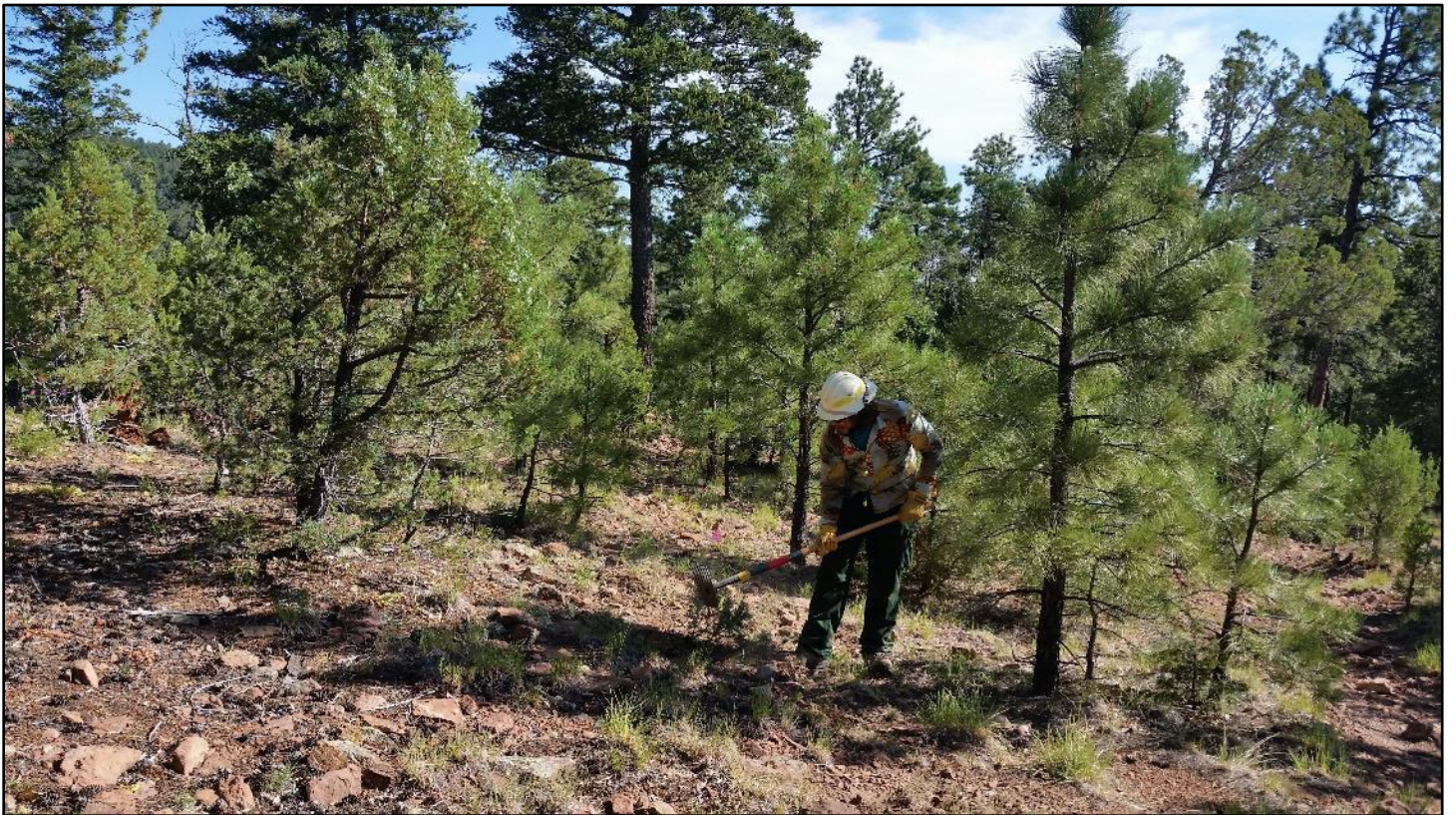
The boss starts to cut in the new Elk Track connection to Madera Locura.