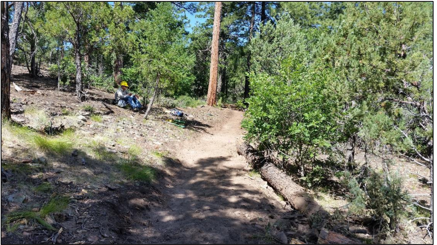
Section finished. Grab a break then head down to the next task.