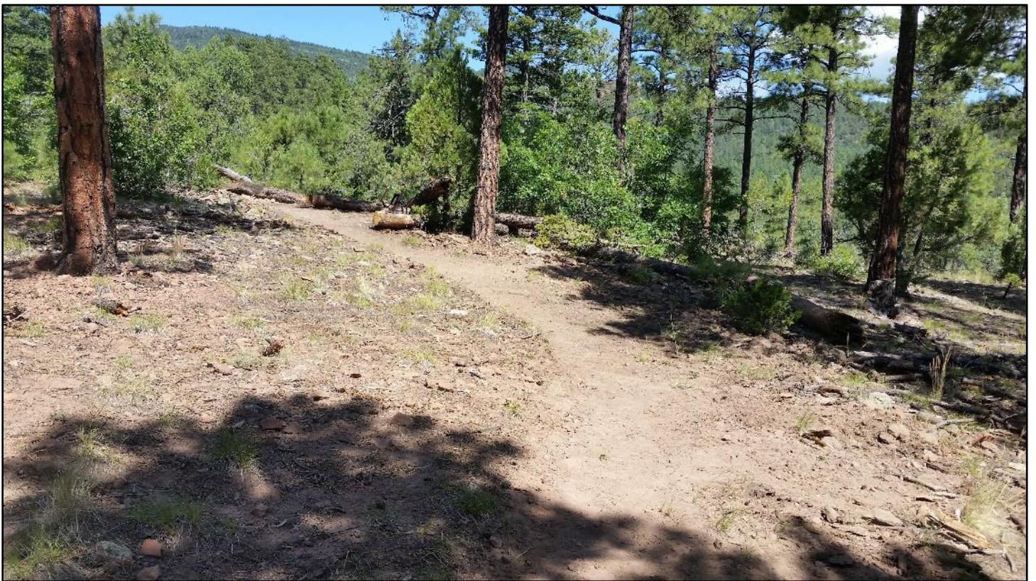
Lower connection is complete. Ready to ride and hike! Just need some rain to pack it in.