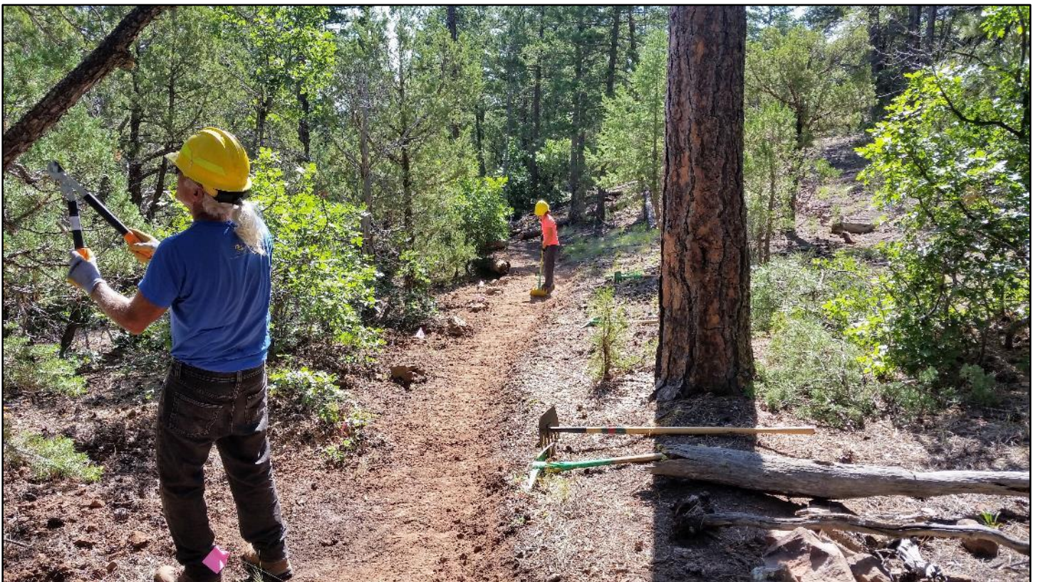
Final clean-up on the reroute's upper connection. The obliterated user trail is to the right.