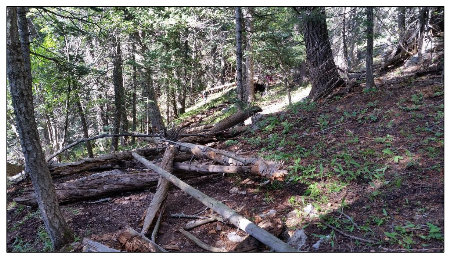
After: deadfall hauled in to block the old trail.