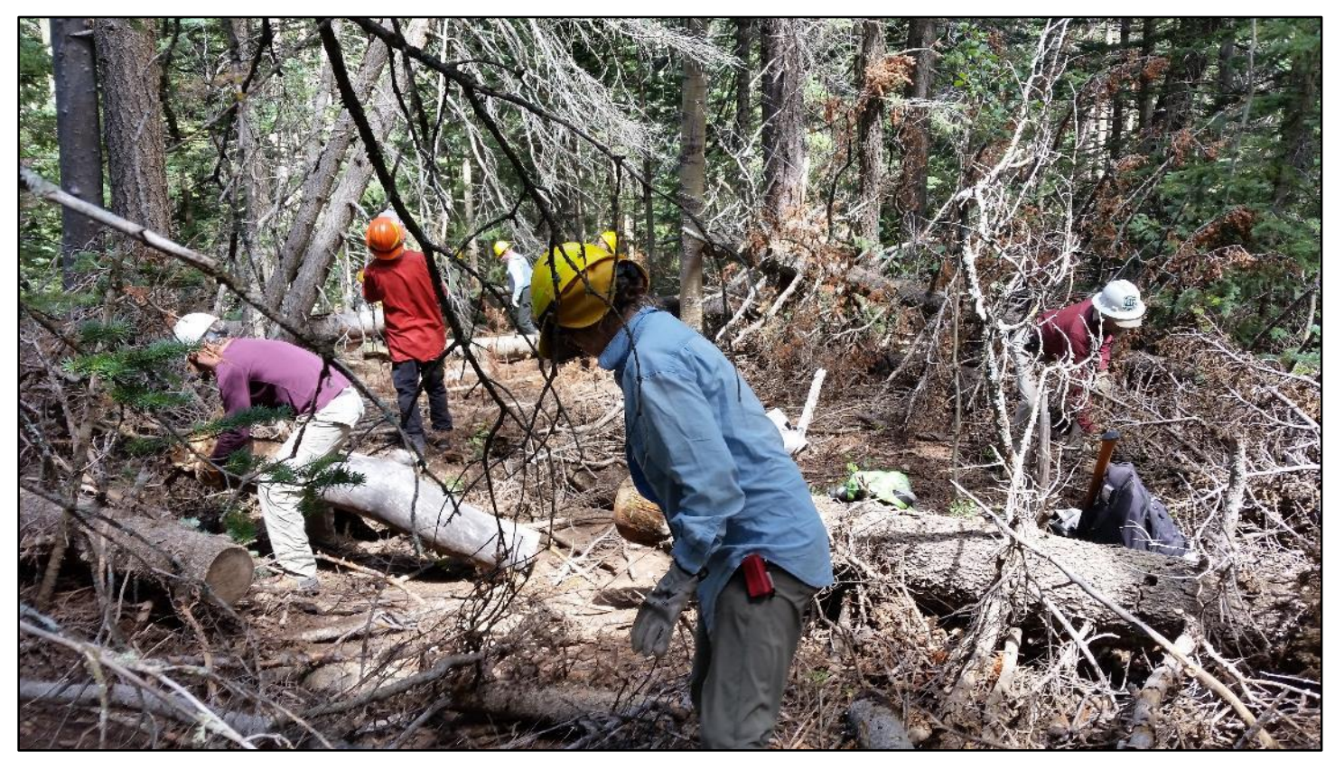
Available obliteration debris was scarce in some areas, overwhelming elsewhere.