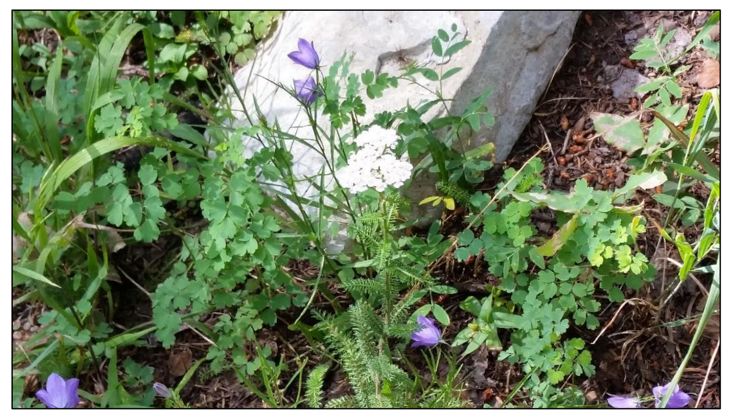
We haven't seen Parry's bellflower lower down in the CATIP.