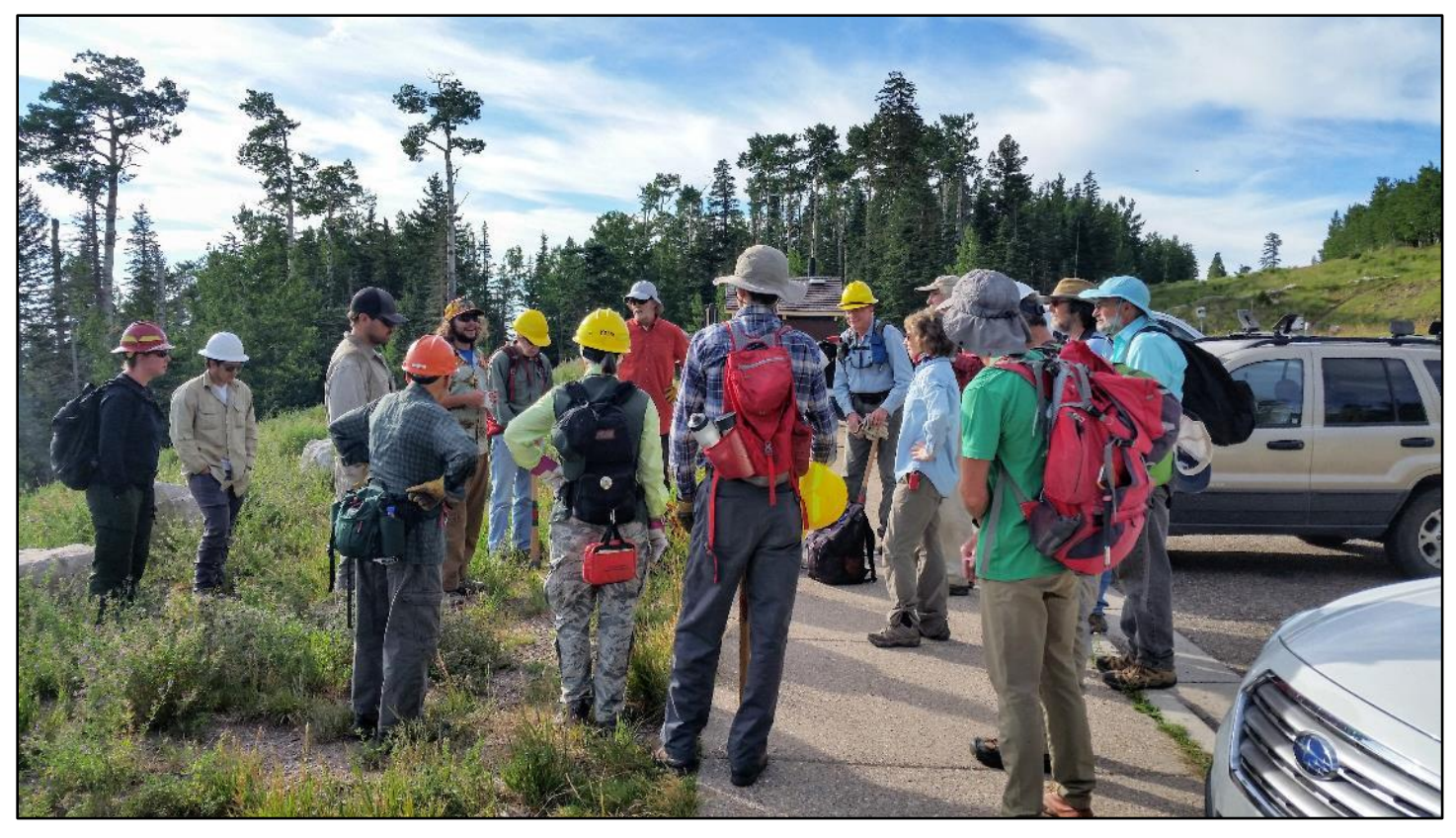
The crew gathers to hear the safety brief and the plan of the day.