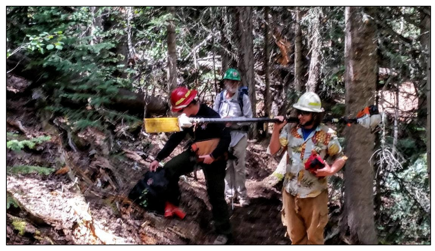
The FOSM power pole saw was used to clear the upper reaches of the trail corridor.