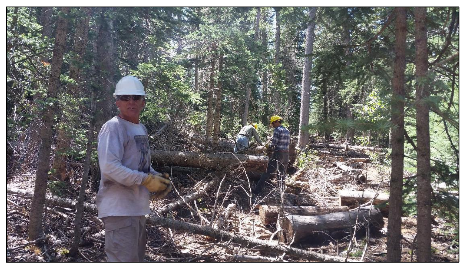
The boss told the crew to use the big stuff in this section. Yes sir, boss!