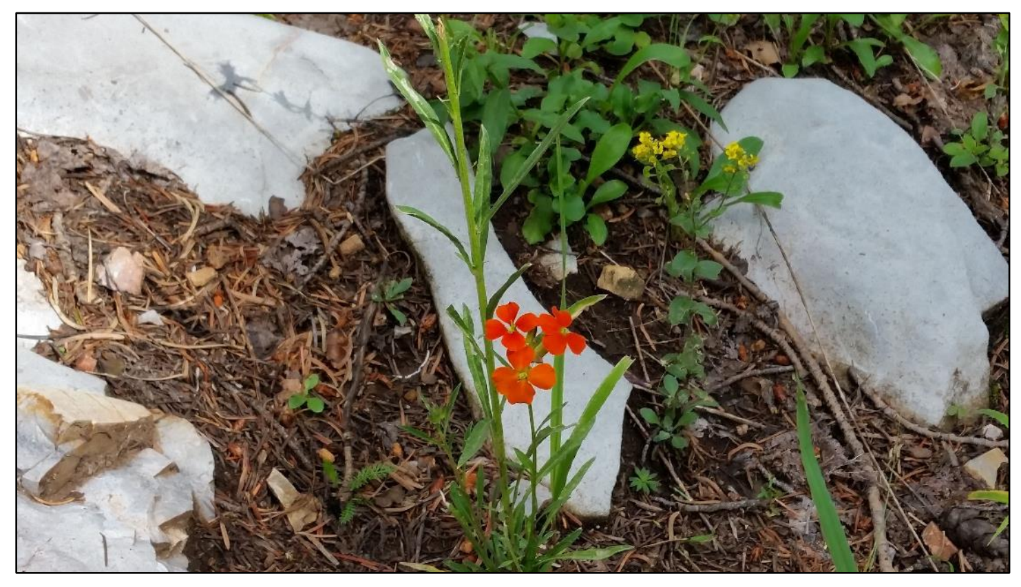
We found the western wallflower is a bright orange at this elevation.

Randomized obliteration has completely erased the old trail, blending it with the surroundings.