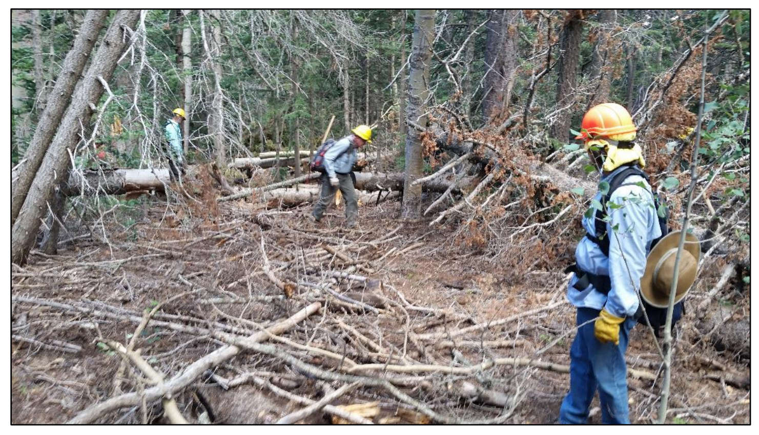
Once the old trail was obliterated, it was tough picking our way out.