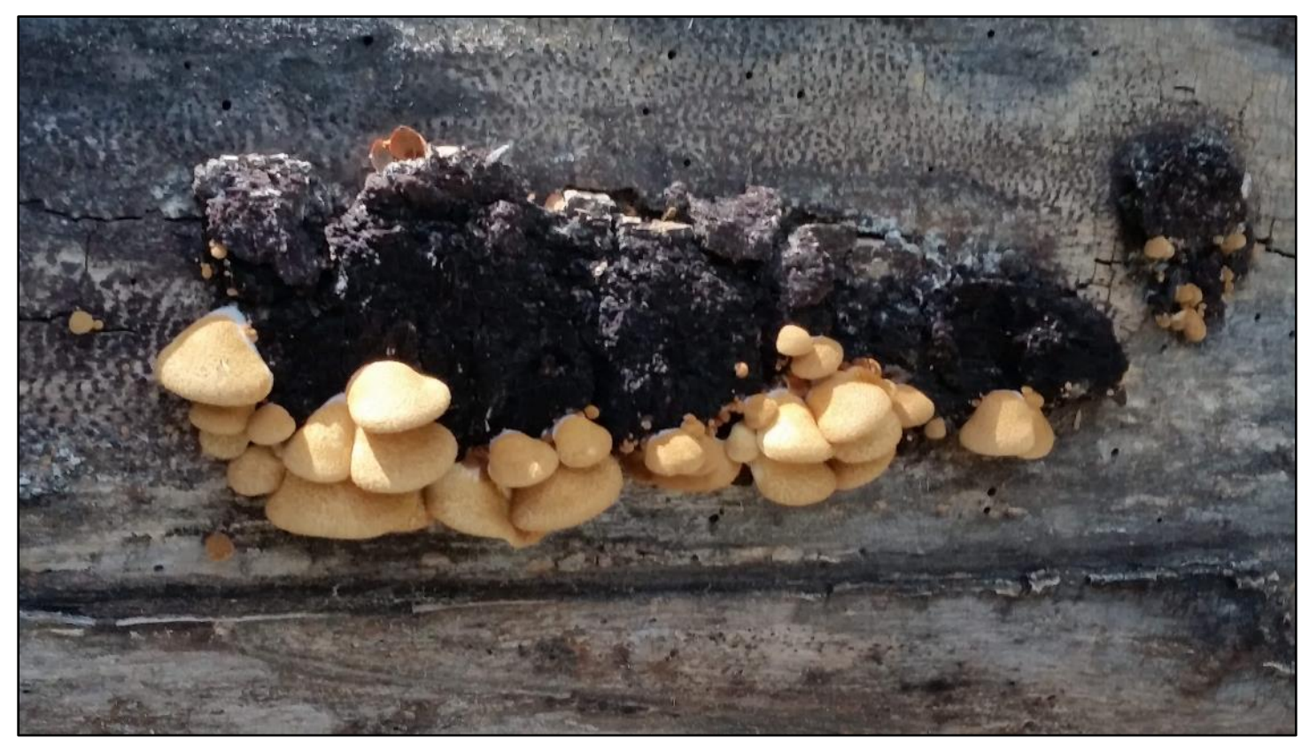
Big decomposing deadfall everywhere was the rule of the day.