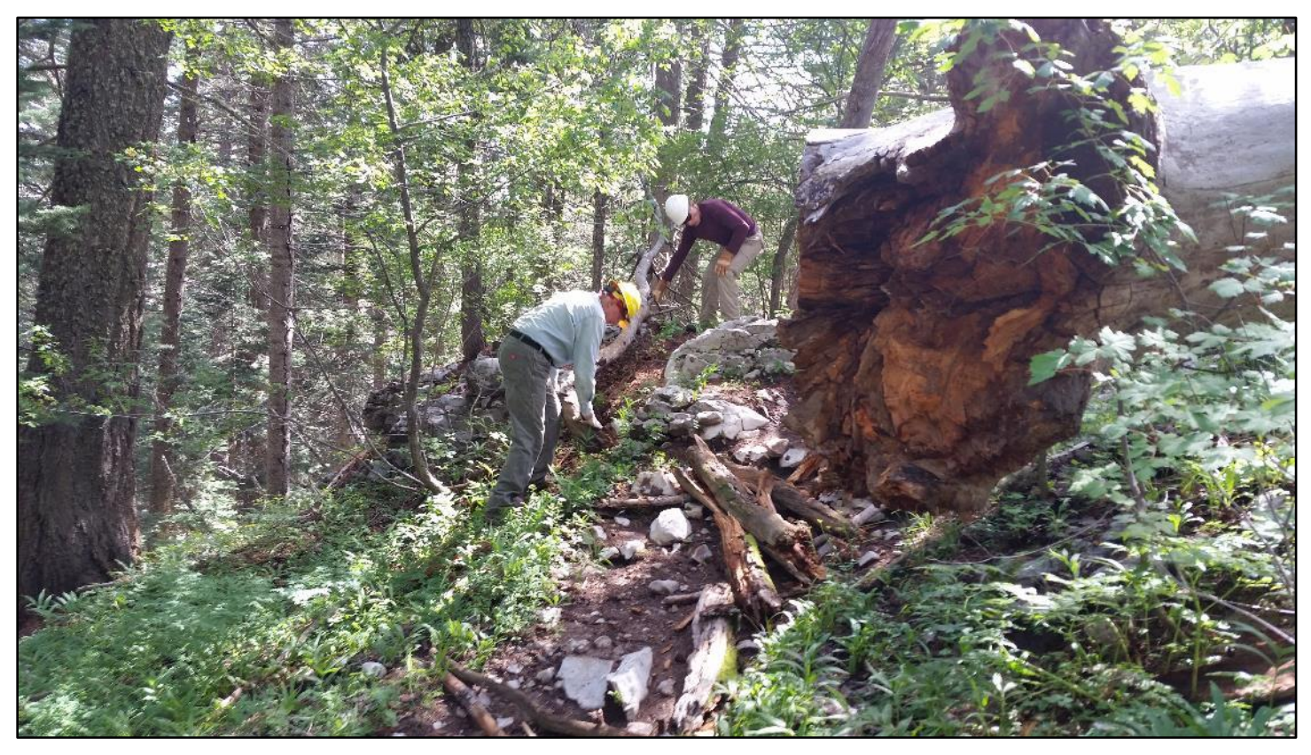
A steep rocky turn in the old trail will be further reclaimed by nature.