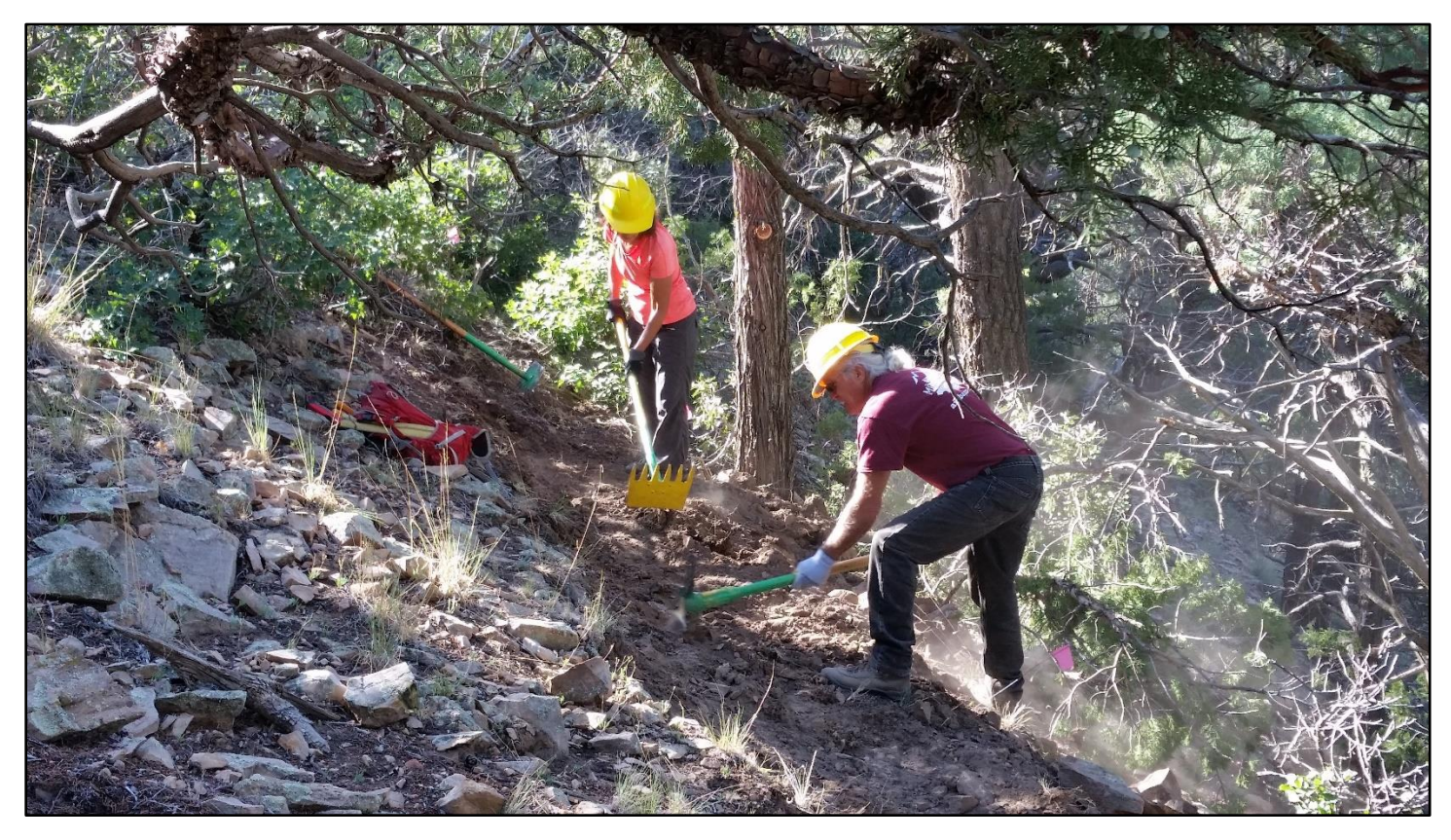
Once all the loose rocks were removed, we found very dusty, fine soil underneath.