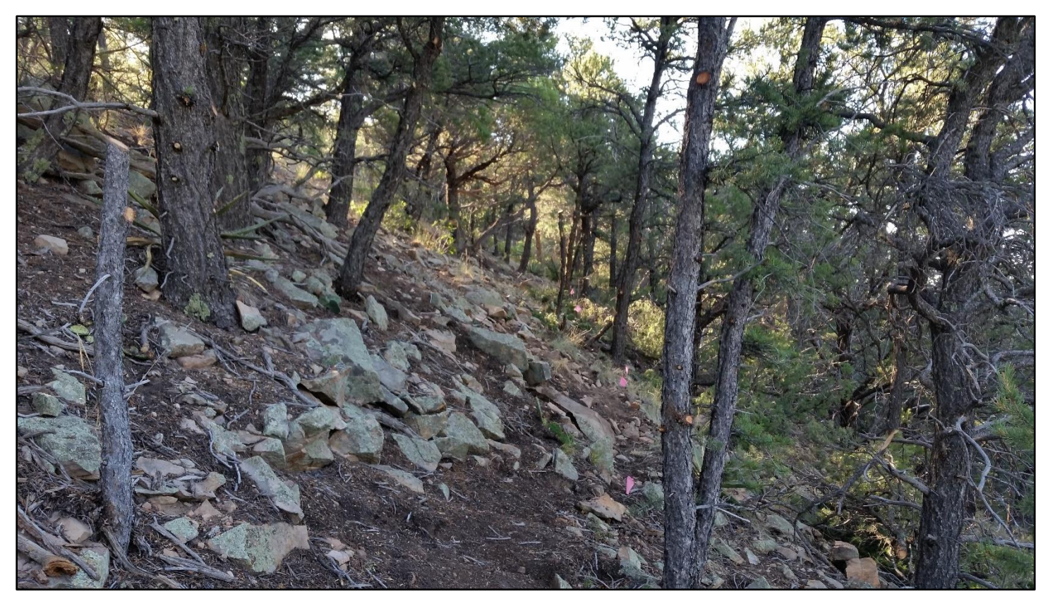
An example of the terrain the crew has to plow through to build Vista Trail.

It is about a mile hike up to the work site; then the crew grabbed tools and pitched right in.