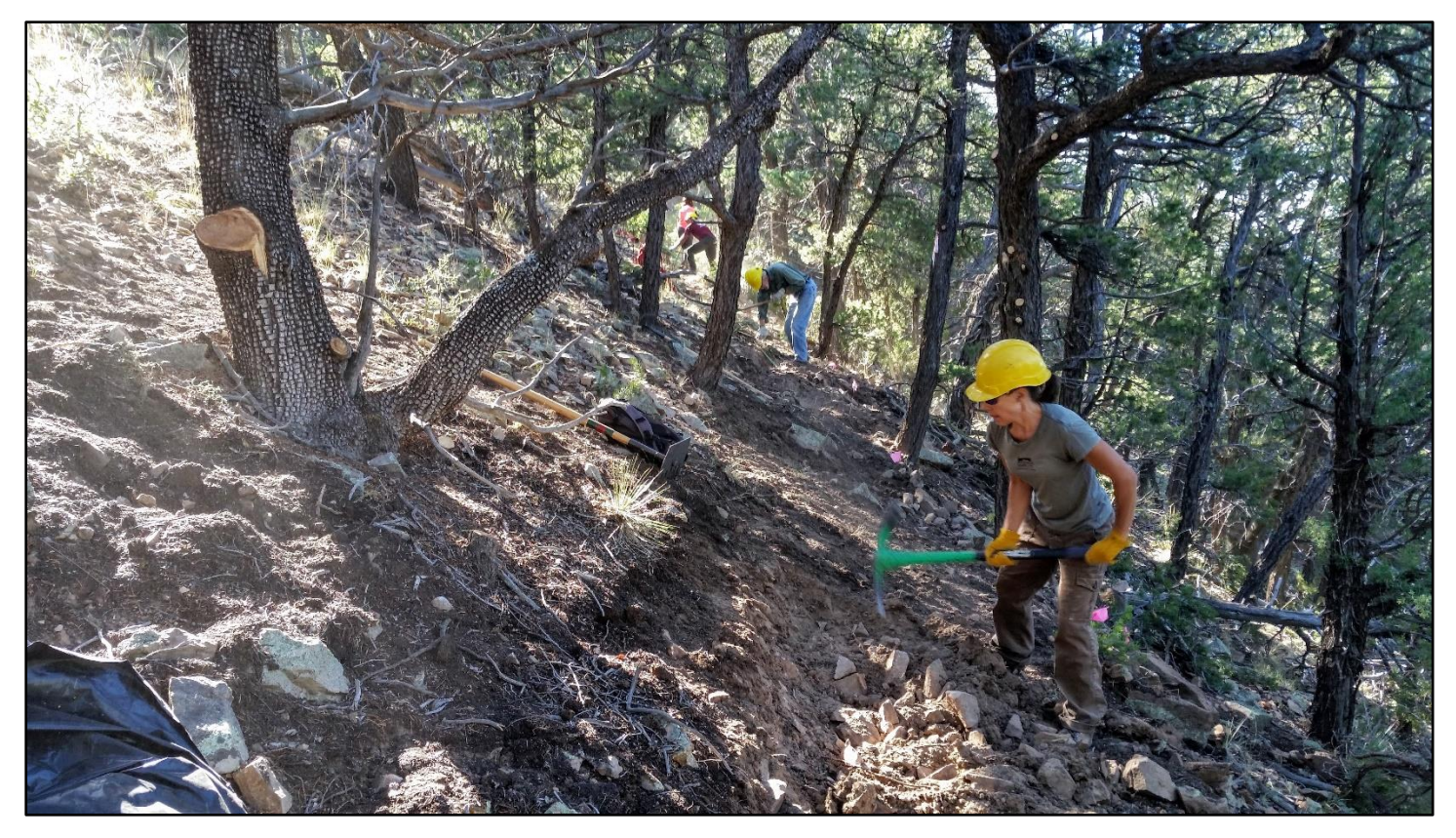
Steep slope and lots of rocks make for challenging tread cutting on Vista Trail.