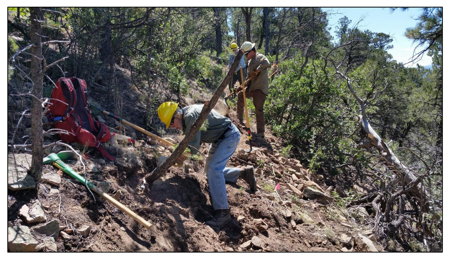
Low-stumping a small pinon. Luckily this one did not need to be dug out.