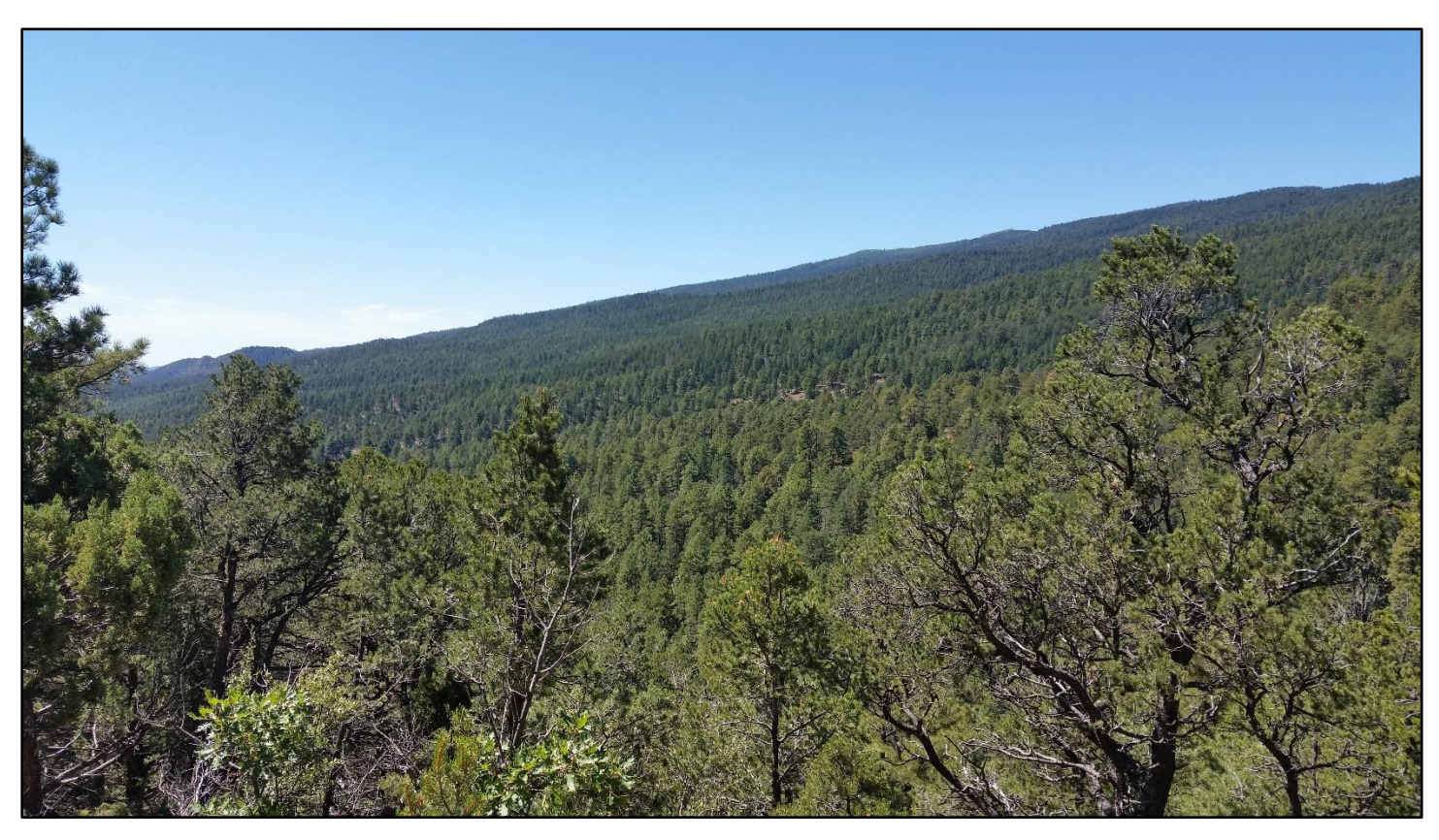
This is why it is called Vista Trail. But there is much more tread left to cut...