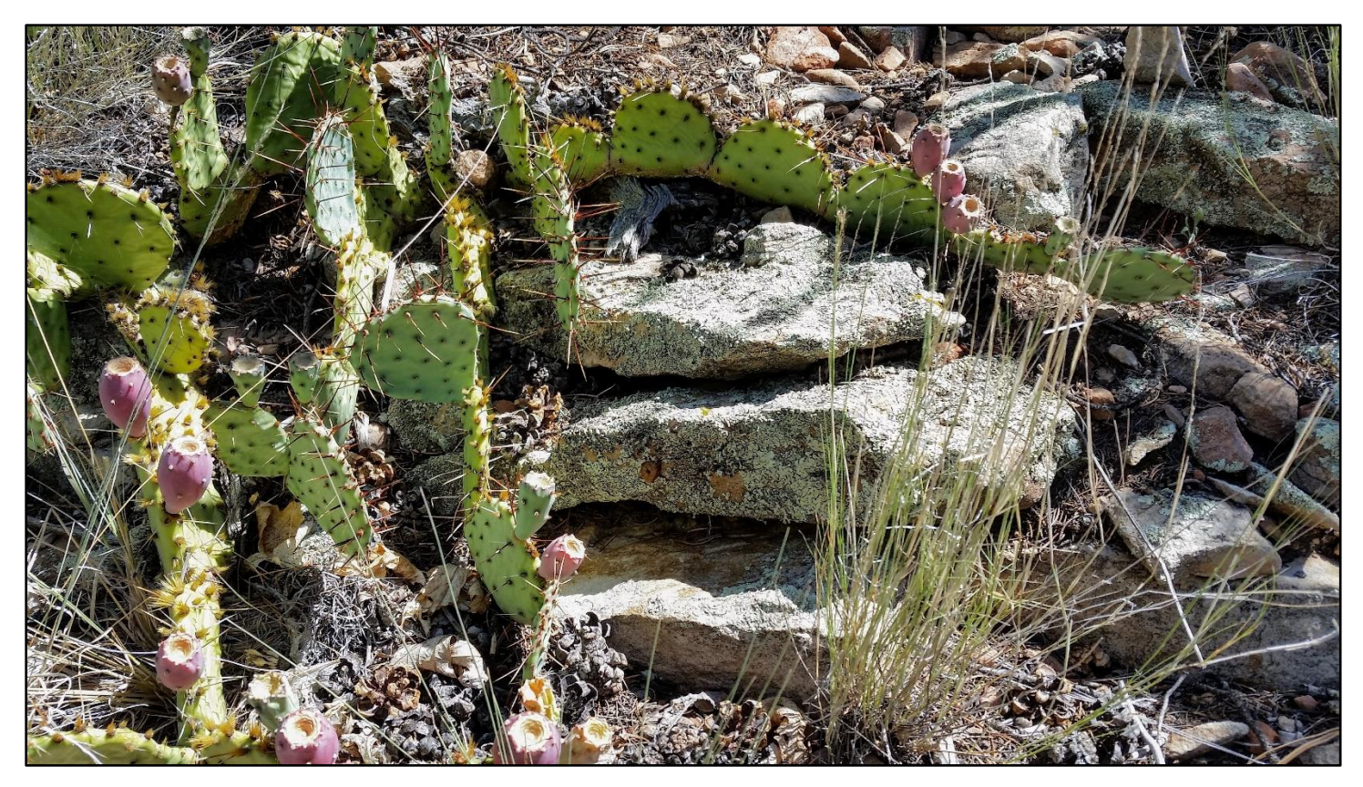
And of course all the prickly pear are bearing fall fruit.