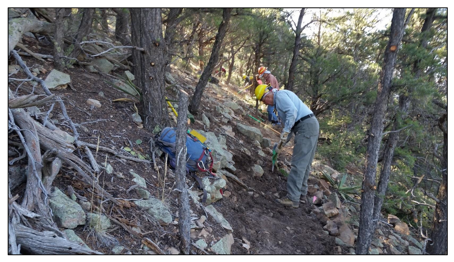
But the crew has busted through this type of terrain many, many times.