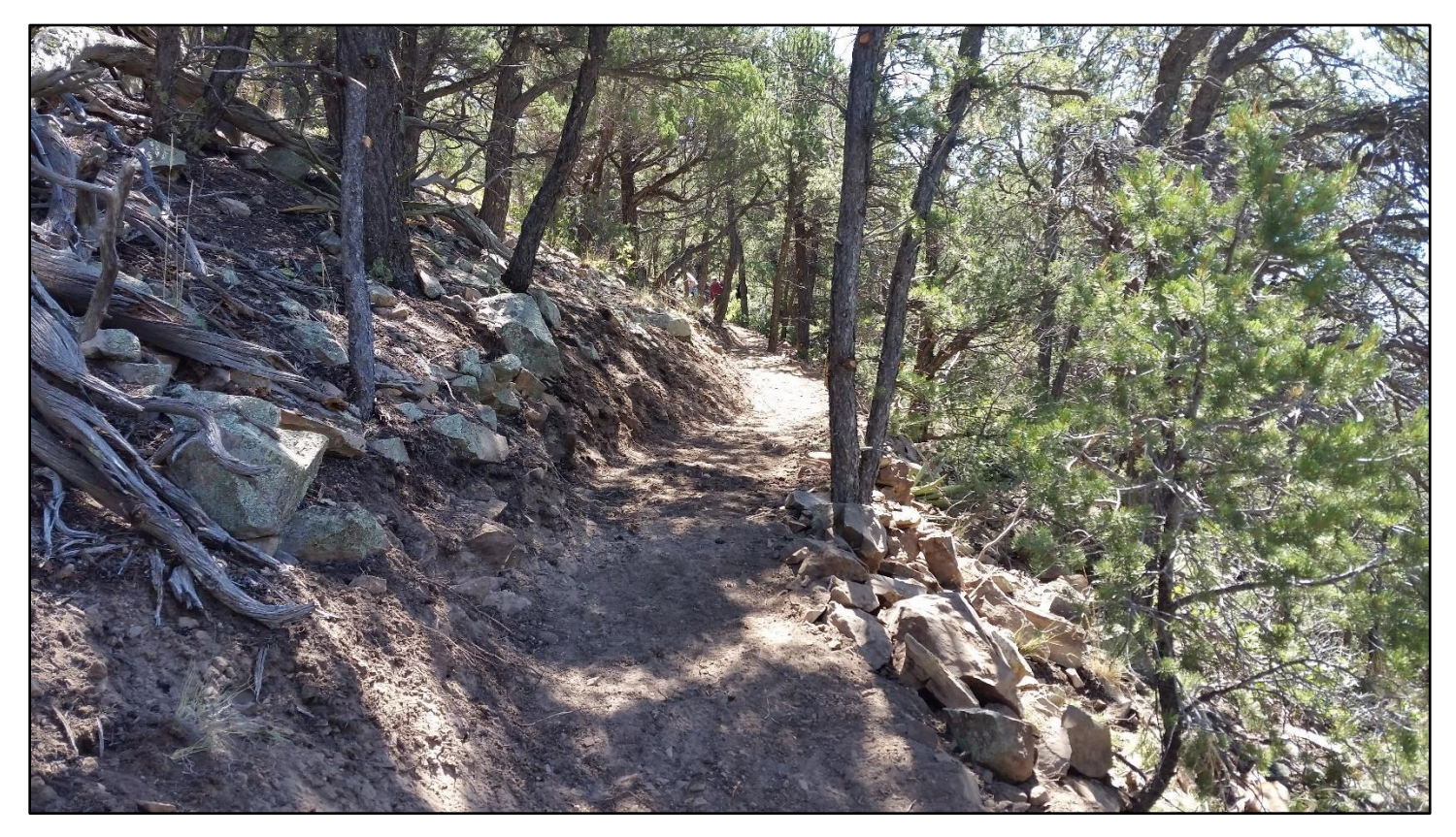
Boom, done! The result is a nice sustainable trail section.