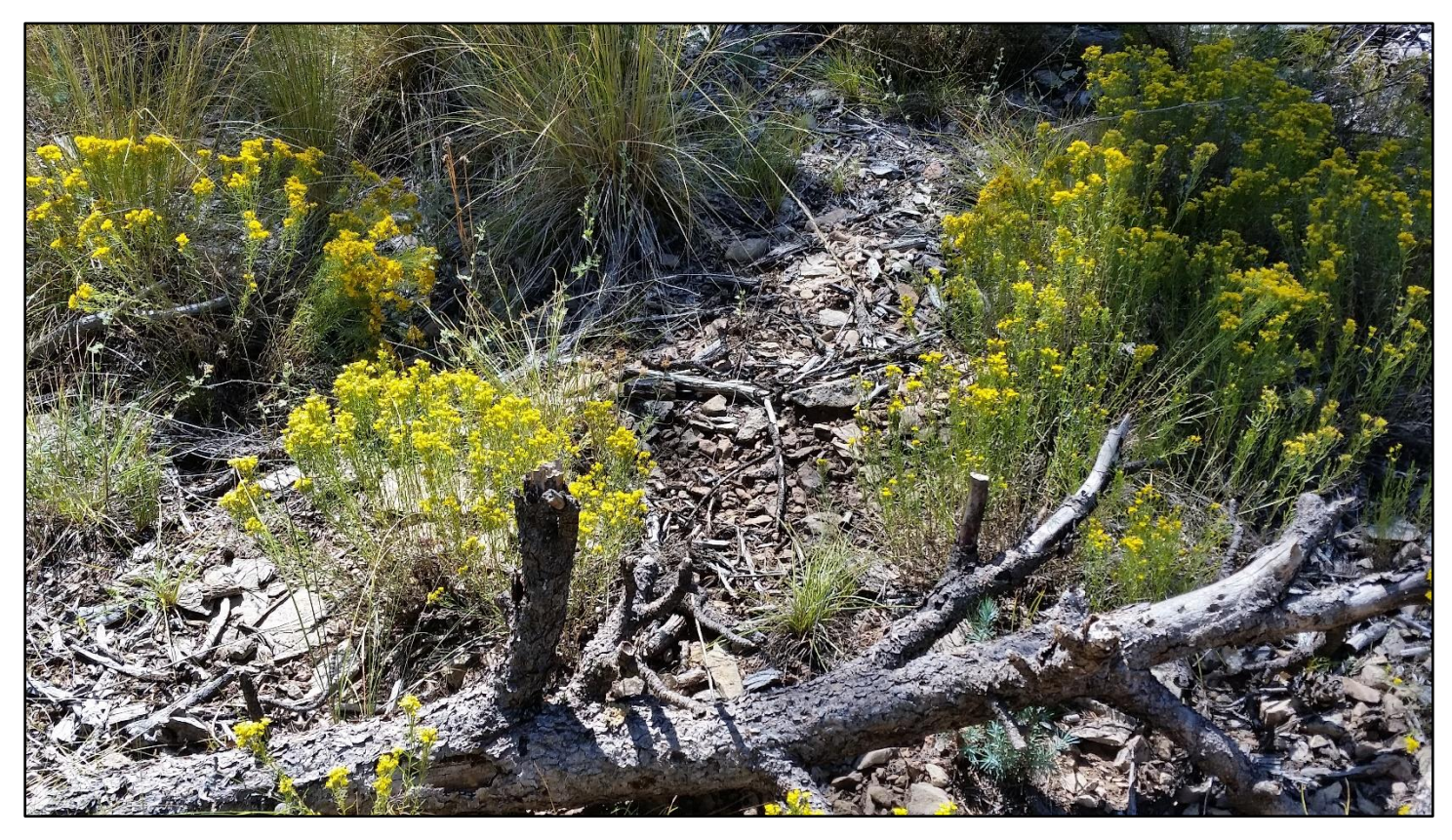
Not many wildflowers are left but the snakeweed heralds the coming of fall.